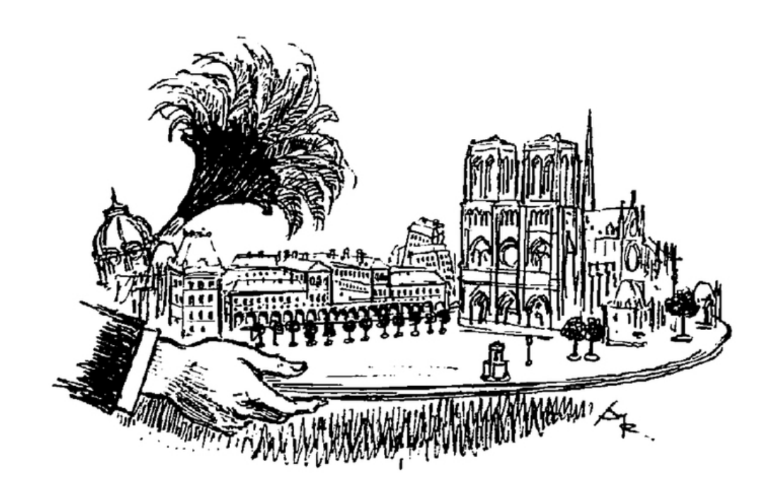
Sur un plateau.

IOP Conf. Series: Materials Science and Engineering 603 (2019) 042088 doi:10.1088/1757-899X/603/4/042088