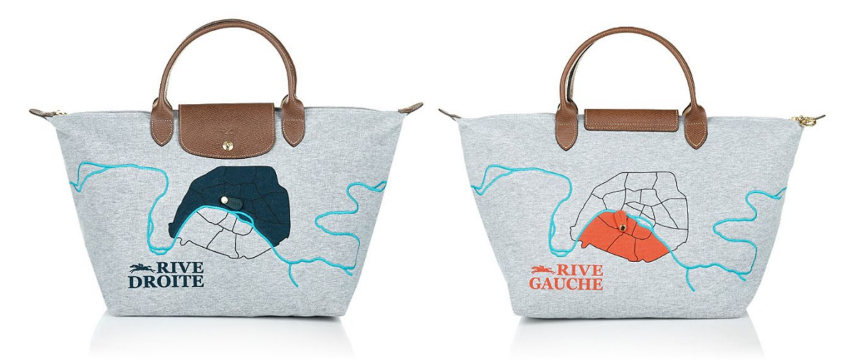
Figure 1. 'Longchamp 2014 Collection: Le Pliage Rive Droite et Rive Gauche '. The imagery of the two banks in which the city is divided compose a strong and differentiated identity of Paris. This can be found in various manifestations such as this Longchamp bags

With its historical central piece, the City Island, the two great halves in which Paris is divided, the Rive Droite (the Right Bank) and the Rive Gauche (the Left Bank) make up two conflicting visions of the city, developed in different times on either side of the river and with very different identities (Figure 1). This binomial, in which the border is the river, assumes its limit as an element of cohesion and meeting point for the city, incarnating the places of power, which, after the revolutionary stages, will turn towards the embodiment of an urban cultural focus, composed of the sum of multiple and successive museum and cultural institutions.