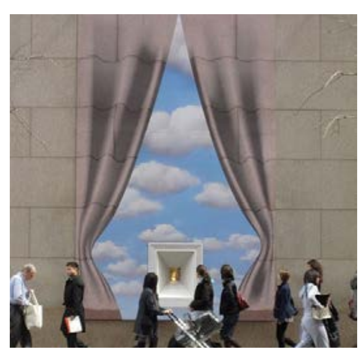
Fig. 12: Window display of Tiffany, New York (NY)

Another option, besides the recreation of concrete works, can be the inspiration in the recurring images in a certain author. This is the case of the windows display of Tiffany (Figure 12) and Loreak Mendian (Figure 13). In the first one, the clear reference to the sky of Magritte (similar to the Les Mémoires d'un saint, where the same curtains appears) can be seen, as well as some of his works in which a canvas appears (The telescope or The human condition). Thus, the jewellery achieves a powerful visual effect by resorting to the surrealist painter's technique, by means of which it suggests an infinite space behind the wall of its façade. On the other hand, in the window of Loreak, the forms and functions that Salvador Dalí gave to elephants in works such as The elephants or The Temptation of St. Anthony are appreciated. In both windows display the product is completely integrated into the work: Magritte's canvas frames Tiffany's jewel and Dalí's elephants carry Loreak's shoes.