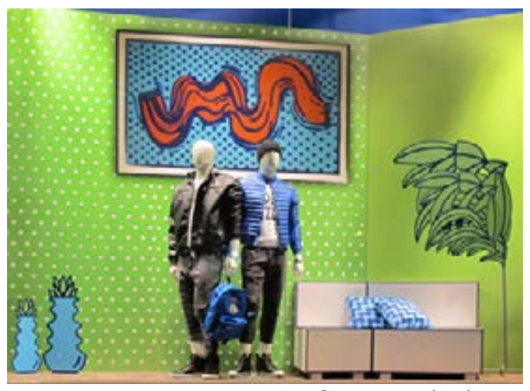
Fig. 16: Window diaplay of Aïzone, Beirut (Lebanon). By Arte Vetrina Project