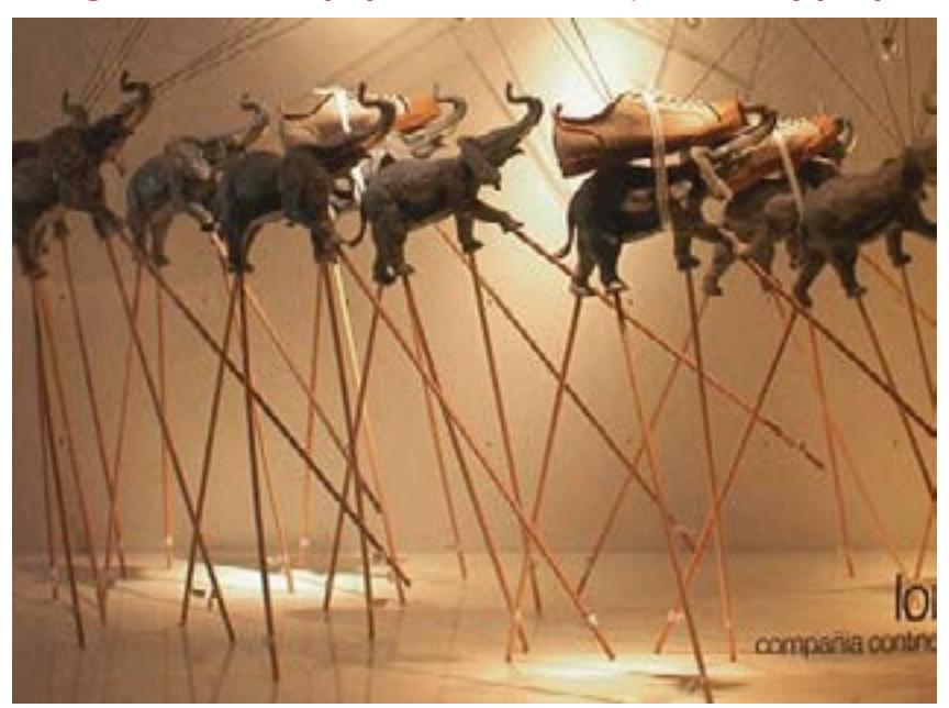
Fig. 13: Window display of Loreak Mendian, Barcelona (Spain)