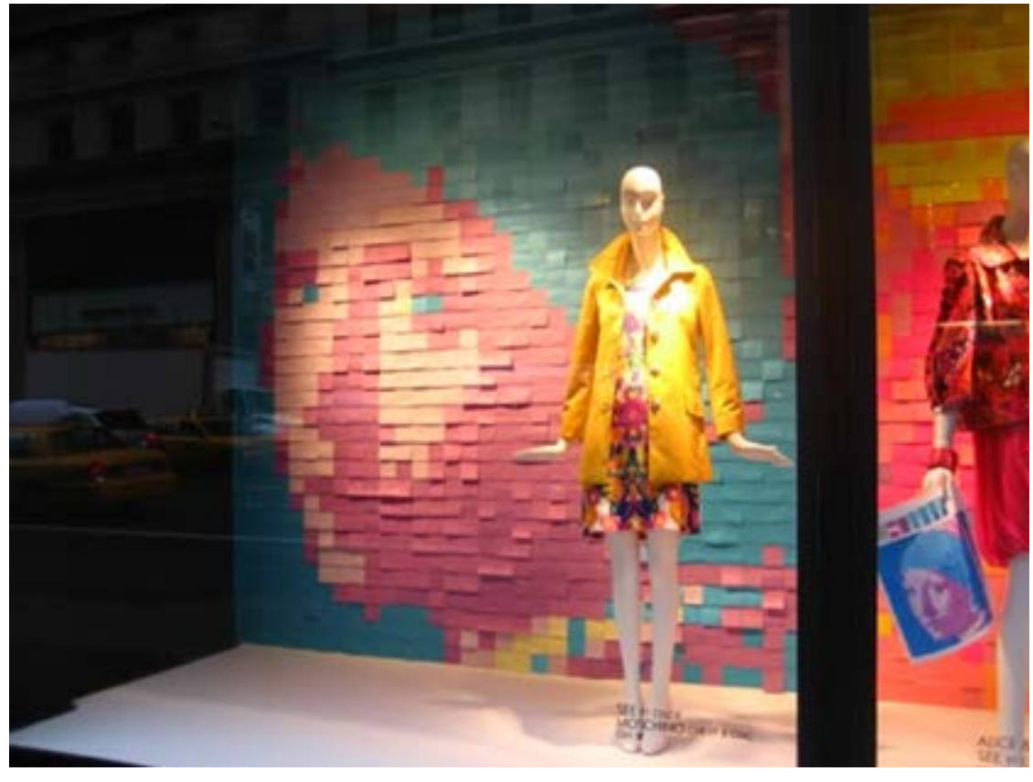
Fig. 9: Window display of Bergdorf Goodman, New York (NY)

The window display of Bergdorf Goodman also stands out as an example, in the sense we are dealing with (Figure 9). It has recreated, in the background, some faces of works of art built from post-it of different colours. In the image we can see, concretely, Girl with a pearl earring, work of the Dutch painter Johannes Vermeer. We place this strategy of management of works of art in the store inside this category (and not in the following, which is about the recreated works) because the offered product is not part of that work; that is, the clothes have not been used to recreate the work. In this case, the reason that has led to the reproduction of the work of art through post-its is the colour: the range of colours used in the window display is similar to the range present in the clothes of the mannequin. The choice of the works, therefore, could be arbitrary, since the original colours have been versioned. However, in the case of the aforementioned image, a well-known (and appreciated by the public) work has been chosen, which reveals values of elegance and sensuality that can be in tune with the product that is being offered in the window display.