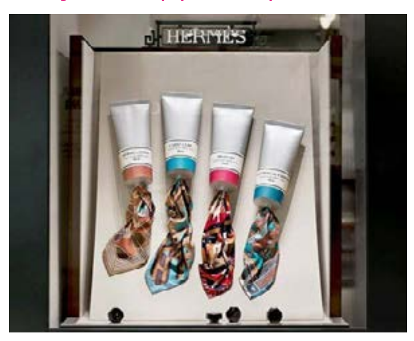
Fig. 4: Window display of Hermès. By Joann Tan Studio

As a final case to this first point, the reference to the world of painting made by Joann Tan Studio for Hermès is worth mentioning, in terms of the artistic setting in general in the store (Figure 4). It is a great example of integration of the product in the theme of decoration, since one of the main reasons that lead to the artistic setting of the store is to highlight the product in an original and striking way. With this assembly, Hermès is highlighting the quality of his handkerchiefs: his tones and his material, enhancing his fluid, silky and, of course, artistic appearance.