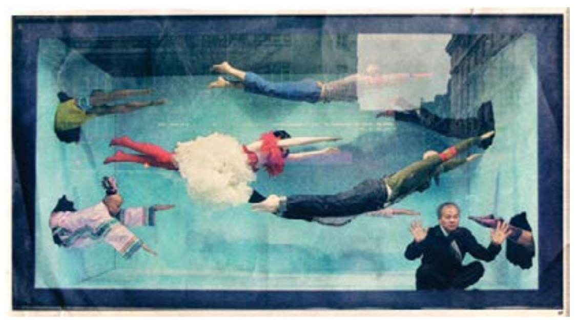
Fig. 3: Chinese artist Wang Qingsong seated in a window display of Selfridges (London, 2006)