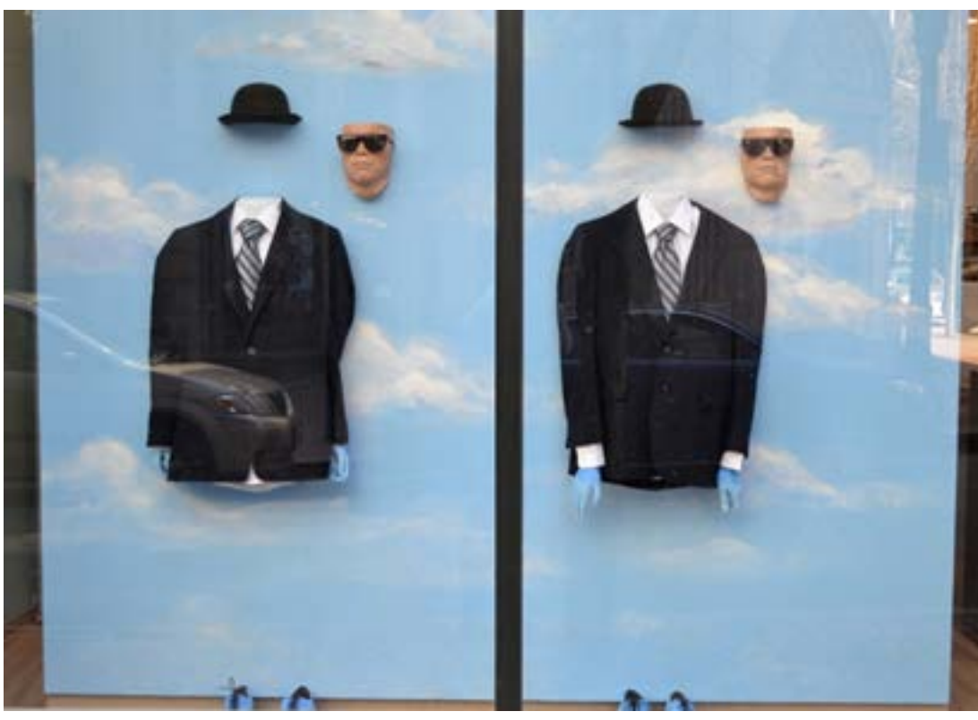
Fig. 11: Window display of Providence Optical, Providence (RI)