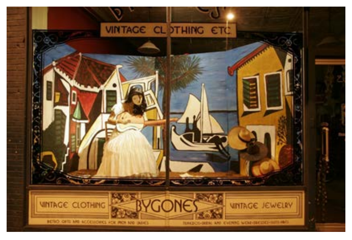
Fig. 14: Window display of Bygones, Richmont (VA) (1)

The shop windows of the Bygone vintage clothing store are a clear example of this symbiosis between the artistic movement, the philosophy of the store and the attention to a particular audience (Figures 14 and 15). Regarding the latter, it is noteworthy that, for the product offered by the establishment, a nostalgic audience is presupposed and, perhaps because of this, knowledgeable about artistic trends. In the first window (Figure 14) a cubist scene is observed, where the store plays with the forms, the perspective and the contrasts of colour; and, in the second one (Figure 15), we can see an impressionist scene, characterized by representing a painting that is being made outdoors (technique intrinsic to the impressionist movement). In both, clothing and accessories are integrated into the landscape: they form a fundamental part of the scene, without which the meaning of the window display is not completed.