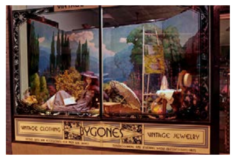
Fig. 15: Window display of Bygones, Richmont (VA) (2)