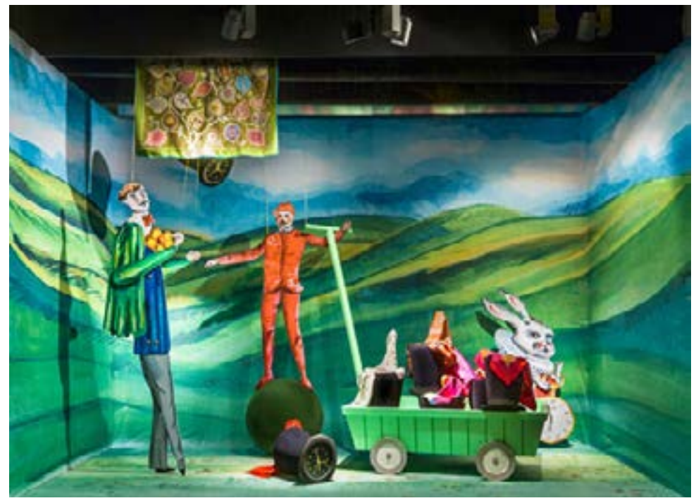
Fig. 2: Window display of Hermès (1), Ámsterdam. By Kiji Van Eijk (2012)