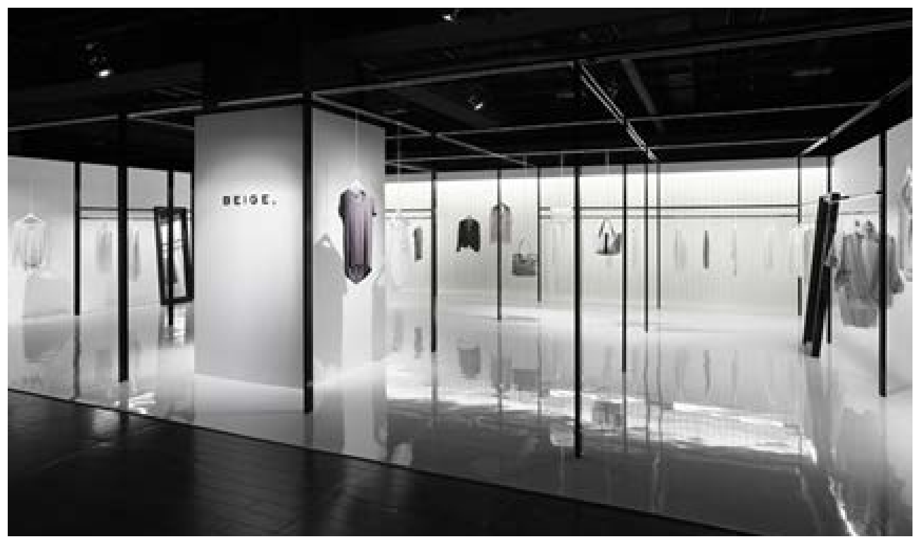
Fig. 5: Interior of Beige, Tokio (Japan). By Nendo

Thus, as an example of a minimalist museum setting in a commercial space, we can refer to two of the interiors designed by Oki Sato (creator of the Nendo studio): the Beige women's clothing store in Tokyo (Figure 5) and the store of Camper shoes in Osaka (Figure 6). As for the first, the recreation of the general atmosphere of a museum is evident. By separating objects, offering each one an outstanding space inside the establishment, and with the studied lighting, Beige invites the visitor to the store to stop at each product to admire it. In this way, the leisurely rhythm of transit is fostered, similar to that existing in a museum, thus allowing reflection for purchase. The same happens in the second case, in Camper's store: the product is exposed giving it the maximum spatial prominence and inviting contemplation. Here, in addition to the exclusivity with which the product is treated, the store also plays with the sensation of movement through the placement of shoes, which further encourages admiration. What, in short, is achieved by managing the interior of the store with the inspiration of a minimalist museum is to highlight as much as possible the product, because there will always be a high contrast between it and the white background in which it is, a contrast that also is powered with a good lighting.