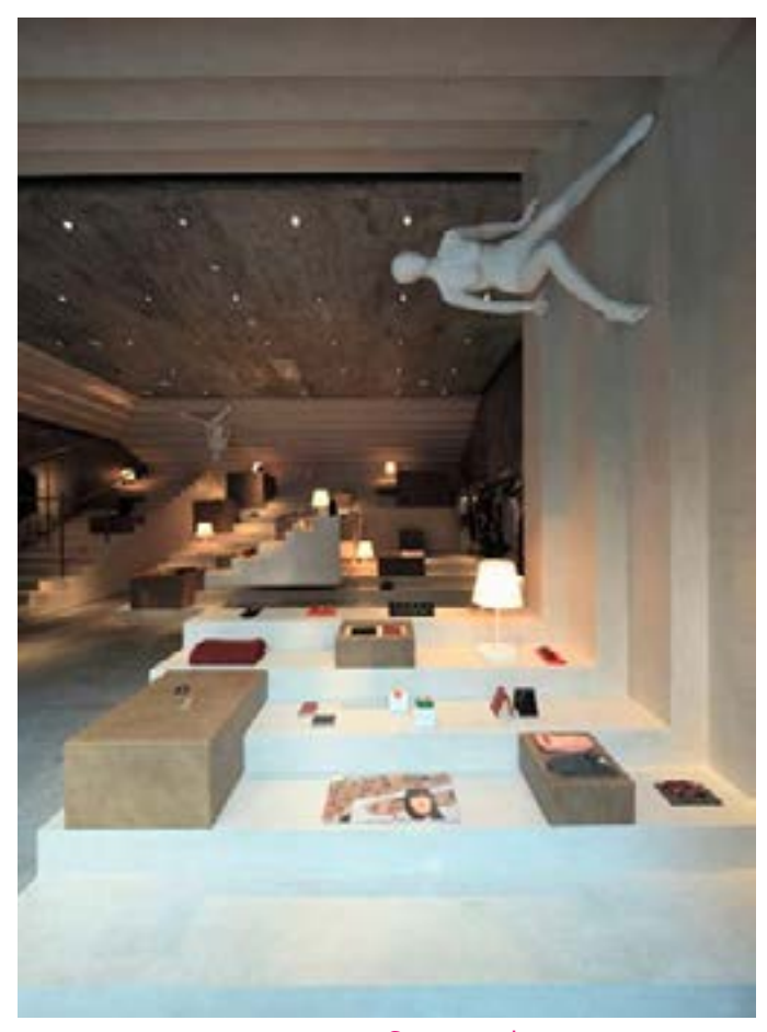
Fig. 18: Window display of Alter Store, Shangai (China)