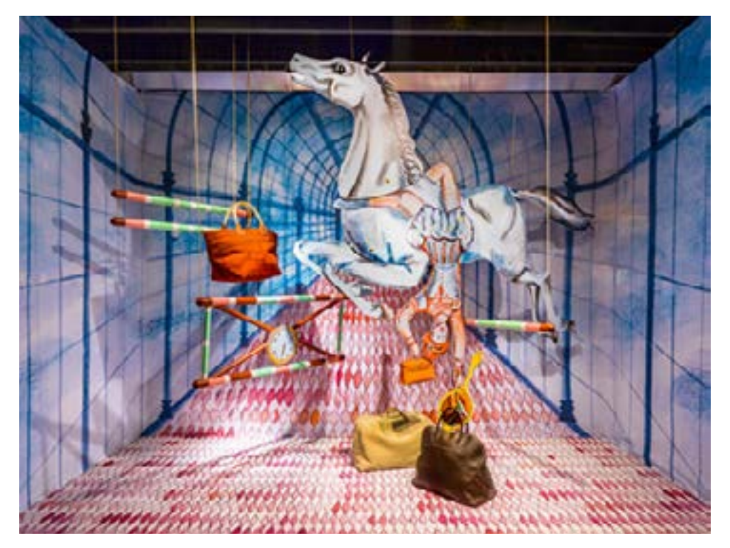
Fig. 1: Window display of Hermès (1), Ámsterdam. By Kiji Van Eijk (2012)