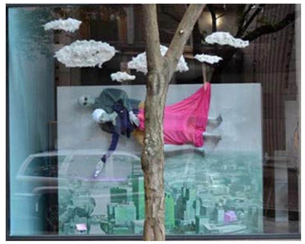
Fig. 10: Window display of Providence Optical, Providence (RI). By Ieva Liepina