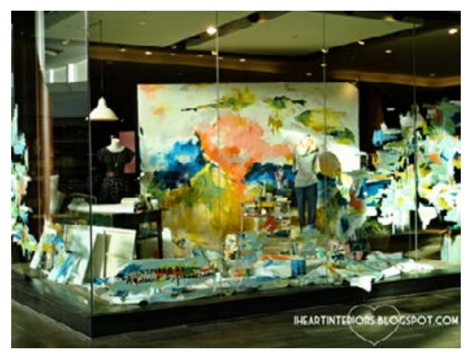
Fig. 17: Window display of Anthropologie, Boston (MA).