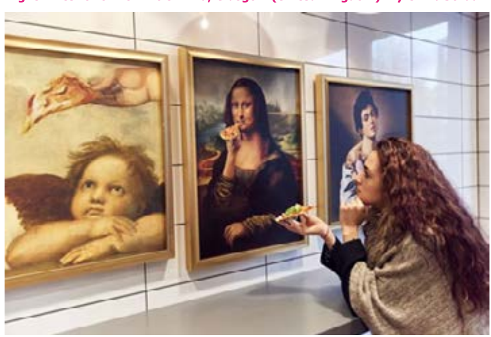
Fig. 8: Interior of Domino's Pizza, Glasgow (United Kingdom). By China Jordan