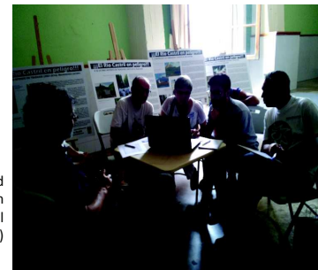
Fig.2: Workshop organized during the XI Andalusian Water Festival Castril (Granada, Spain)