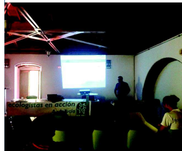
Fig.1: Presentation of the project in the XVIII Assembly in Andalusia of the Association "Ecologists in Action" El Bosque (Cádiz, Spain)

2 nd Step: Organization of workshops with activist groups in which the form was explained and feedback on the form was obtained. Participants in the workshops were divided into groups and each group entered a conflict or mobilization of their choice in the map.