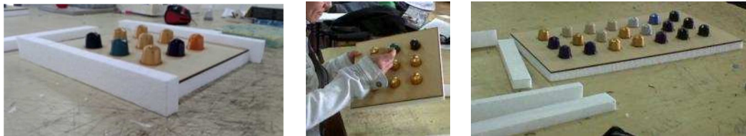
Fig. 6 “Manufacturing of molds with recycled polystyrene and coffee capsules”. Source: the authors

acrylic sealant). A mesh is also incorporated to withstand the bending, this mesh can be of metal, fiberglass or recycled plastic. There is the possibility to add color in the manufacturing stage in a simple and inexpensive way sprinkling the molds with ferrite before pouring the mixture. In this case it will be necessary to apply a water based finishing laquer to the plates. After moulding it should be applied manual or vibrated compaction. The molds that are used in this research are of our own design and are made mostly with construction waste such as expanded polystyrene, wood, phenolic wood and MDF for the main body of the molds and residues such as coffee pods, remains of pipes or PET bottles to achieve the perforations in the case of perforated plates or hollow blocks (Fig. 6).