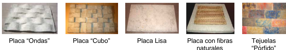
Fig. 5 “Some models of plates for walls cladding”.

Papercrete plates turn to be lightweight, resistant to fire and evidence properties of thermal and acoustic insulation. They can be compared with the gypsum boards, with the advantage that they do not rot in contact with water in the event of a leak. They can be used as plates for ceiling and interior walls cladding. They can be applied on a wall as a ceramic tile. Alternatively they can be mounted on metal or wooden slats, replacing the plaster and thus saving material and workmanship in this category. They are paintable, they can be sawed, bolted and nailed [9b]. The joints can be apparent and part of the aesthetics of the wall, without bands and putty for joints, which in drywall are frequently evident. They can be manufactured with different embossments (Fig. 5).