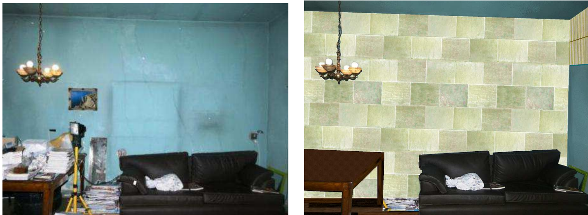
Fig. 7 “Prior to the intervention image: wall with visible cracks (left). Photomontage of wall cladding design (right)”.

During this stage the walls cladding will be done using flat and embossed papercrete plates. The plates will be mounted on wooden slats forming an air chamber (Fig. 7). The existing cracks will be hidden this way, achieving a better hygrometric, thermal and acoustic performance which are fundamental topics for a divider wall.