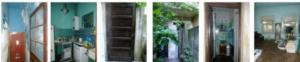
Fig. 2 "Photographic survey of the Ground Floor".