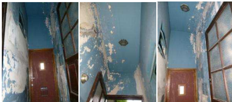
Fig. 3 "Photographic survey of the Hall".