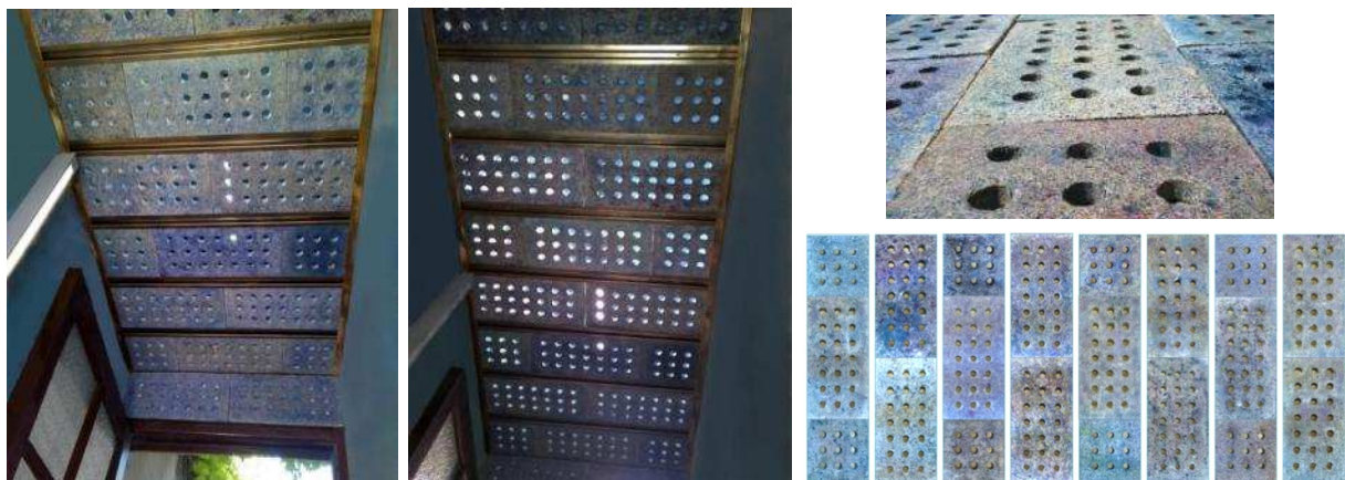
Fig 4 “Plates used for the ceiling and ceiling of the Hall completed”.

The plates were assembled in half an hour by two people on omega decorative profiles, with satisfactory result (Fig. 4). Its advantages and possible disadvantages will be evaluated throughout two years from its placement.