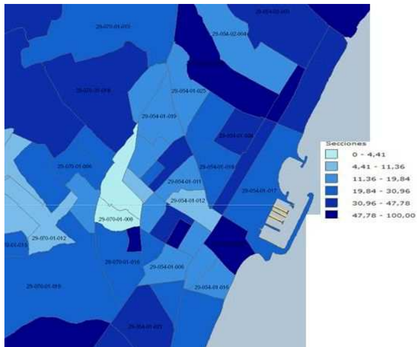
Fig. 2: Census Sections. Districts 1 y 2. Fuengirola. Census 2011.

Following the analysis, this paper identifies vulnerable areas located in the coastal strip between Torremolinos and Marbella, included in the Study on Vulnerable Neighborhoods: