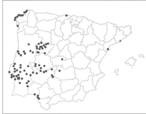
Figure 1. Distribution of Azolla filiculoides Lam in the Iberian Peninsula. [data acquired from Pereira et al. (2001), Real Jardín Botánico (2005) and herbarium material deposited in the herbaria MA (Real Jardín Botánico Madrid), BC (University of Barcelona) and LISU (University of Lisbon)]. ■ First record in Iberian Peninsula. ▲ First Record in Spain. ● Other records. Distribución de Azolla filiculoides Lam. en la Península Ibérica [datos obtenidos de Pereira et al. (2001), Real Jardín Botánico (2005) y material de herbario depositados en los Herbarios MA (Real Jardín Botánico Madrid), BC (Universidad de Barcelona) y LISU (Universidad de Lisboa)]. ■ Primera recolección en la Península Ibérica. ▲ Primera recolección en España. ● Otras recolecciones.

The purpose of this note is to notify the invasion by this exotic aquatic fern of a great natural and valuable protected European space, and to present some considerations about the problems this invasive plant can cause in its native ecosystems and the difficulties that its control in a natural preserved area present.