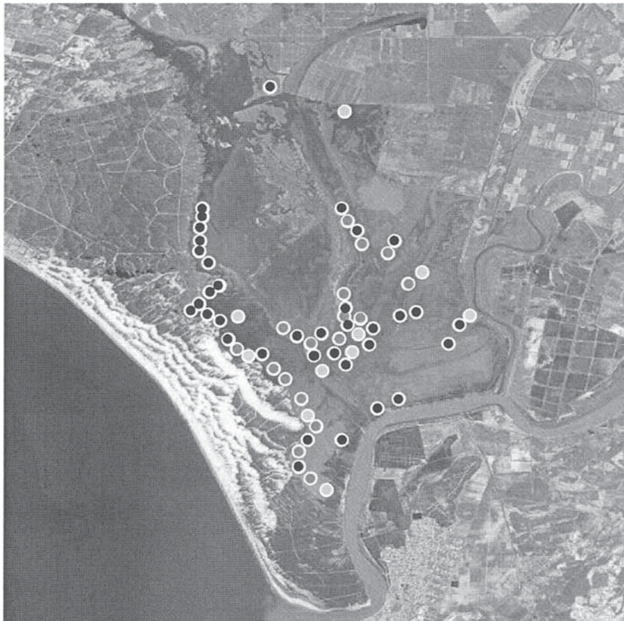
Figure 3. Cartography of the Azolla filiculoides invasión. ● 2001 records, ● 2002 records, ● 2003 records (adapted from García Murillo et al. , 2004). Cartografía de la invasión de Azolla filiculoides . ● Recolecciones de 2001, ● Recolecciones de 2002, ● Recolecciones de 2003 (adaptado de García Murillo et al. , 2004).

At the moment, we can only think about keeping the integrity of native ecosystems (keep few nutrients in the water, keep a low pressure of livestock, prevent eutrofization, etc.) as a better solution to avoid the spread of Azolla filiculoides ' infestation through all water bodies of Doñana.