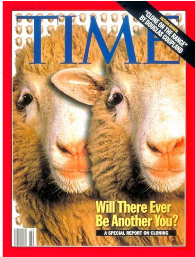
Figure 4. Cover of Time magazine (10 March 1997)

scenarios are presented as perverse and are morally assessed. These hypothetical examples find their way into the collective conscience, acquiring a certain dose of credibility [19]. Before such scenarios actually occur, people already have a more or less detailed idea of the motivations that others might have to resort to cloning. In order of appearance in the media, Hopkins has detected the following: