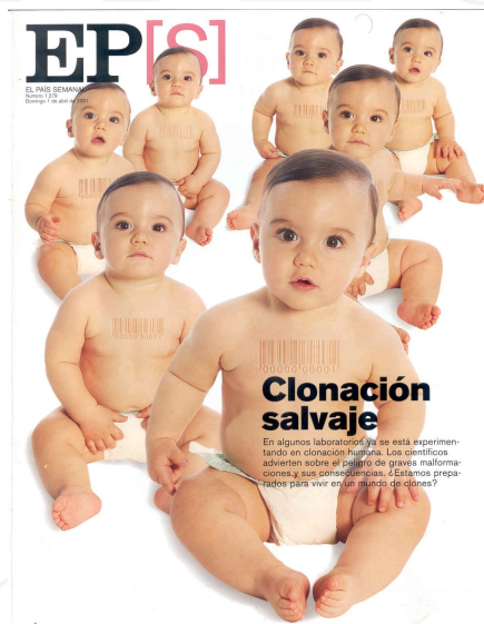
Figure 3. The photographic composition illustrating the report Clonación salvaje (Savage cloning) reinforces the "exact copy" myth, so frequent in popular representations of human cloning.

One of the most alarming images that the mass media highlighted about cloning was the "loss of individuality". The idea that a cloned person is not a unique individual implies two very closely related assumptions [19]. The first is that however exact the copy (clone) is, it does not transcend its condition of "laboratory counterfeit". The spurious nature of the clone is identified with its illegal provenance. After announcing a five-year federal moratorium on human cloning, Bill Clinton, the then President of the United States, stated this perception very eloquently. 5 Indeed, a clone, as an illegitimate laboratory copy, is regarded as an unnatural entity, that is, artificial, and therefore its "production" is contrary to human dignity. The story in Time magazine, for instance, held that "Dolly does not merely take after her biological mother. She is a carbon copy, a laboratory counterfeit so exact that she is in essence her mother's identical twin" (10 March 1997, p. 62).