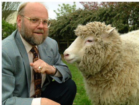
Figure 1. Professor Ian Wilmut and Dolly