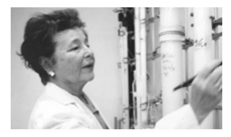
Figure 9. Gertrude Belle Elion working in the lab.