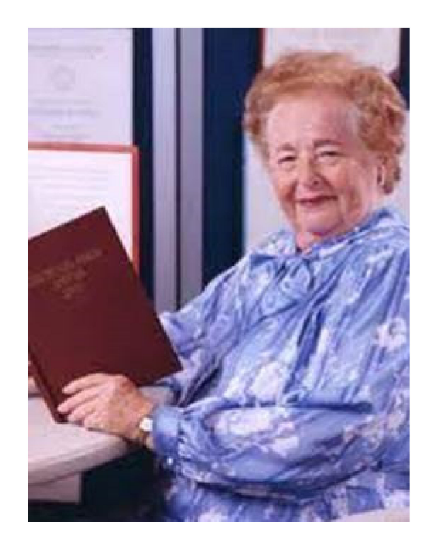
Figure 12. Gertrude Belle Elion.