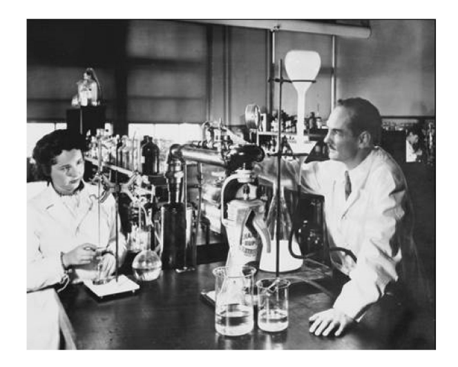
Figure 10. Gertrude Belle Elion and George Herbert Hitchings in the lab in 1948. Source: [7].

Among Gertrude Belle Elion's publications of her research, which she carried out individually or in collaboration with other researchers, particularly with George Herbert Hitchings, the following can be cited: