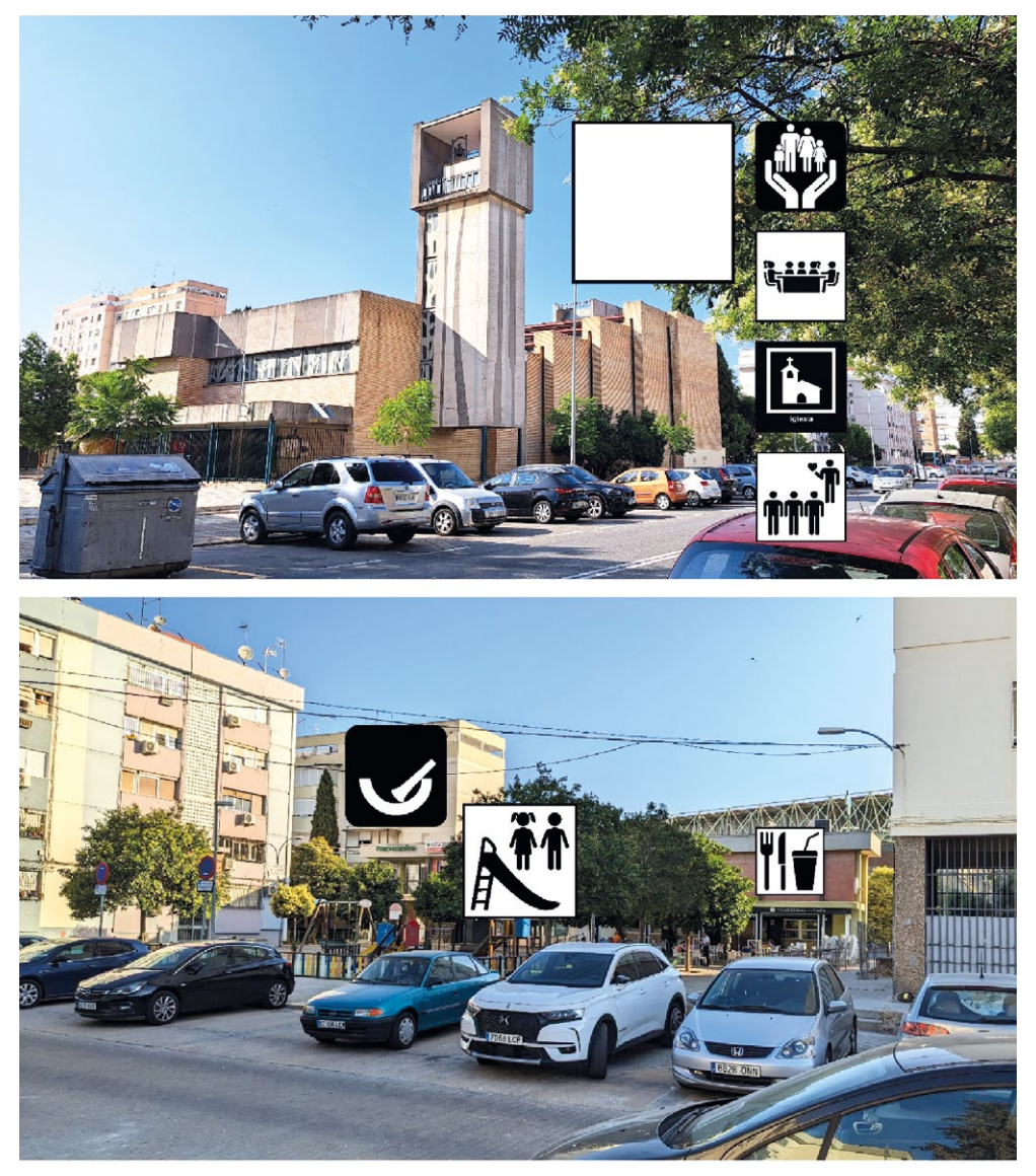
Fig.05 Evaluation of the cognitive accessibility of Avenida de la Soleá, San Pablo, Sevilla. Inclusión Activa

course, students, based on the results of the research, will be able to contribute a study of heritage values from another perspective. Furthermore, learning in this area of knowledge can be used transversally for other learning areas of architecture and urban planning.