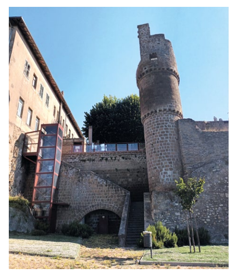
Fig.01 Elevator access to Giardini d'inverno, under La Rocca, in Vetralla, Lazio.