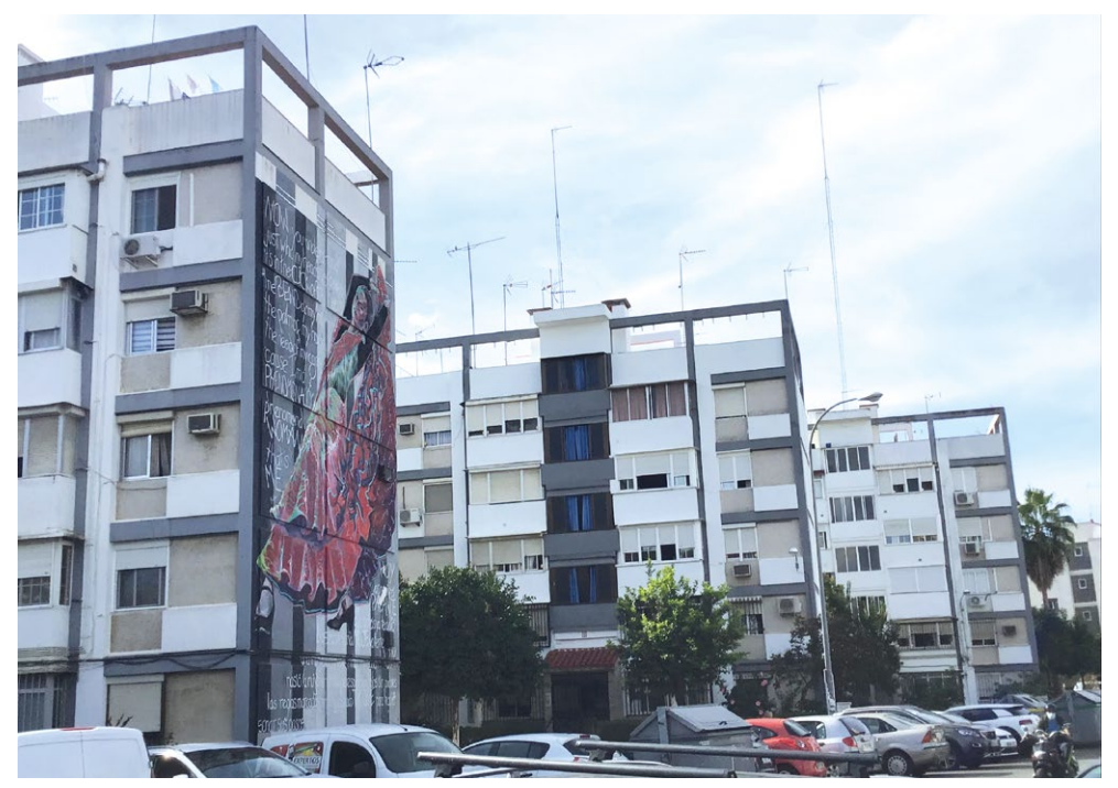
Fig.04 Avenida de la Soleá, San Pablo, Sevilla. J. Peral

the neighbourhood, settling on it the main uses of the entire residential complex. On these uses there are pictograms that are already designed and evaluated, especially those that refer to buildings for administrative use (GTAAC, 2021), however, it has been considered necessary to design and evaluate pictograms that are related to the characteristics of a residential neighbourhoods. The initial evaluation of the team will allow work on the theme and the number of pictograms.