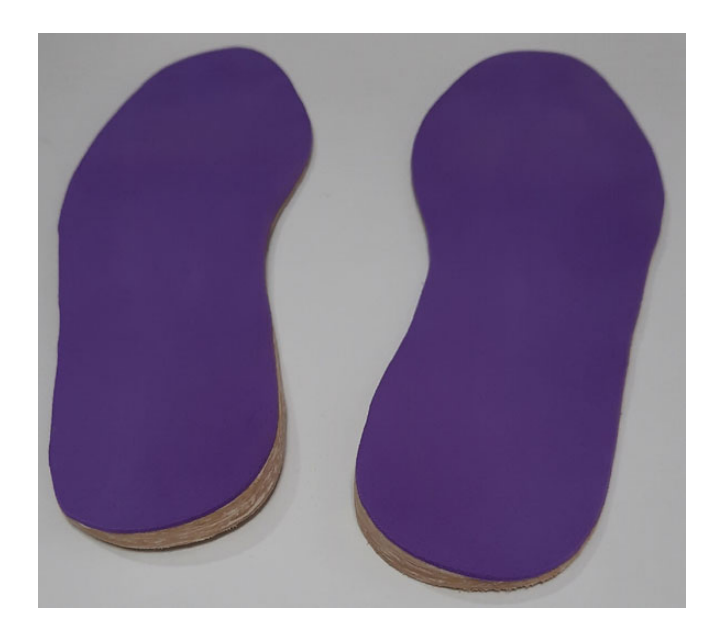
Figure 2. Classical medial wedge orthosis with 3 mm-thick medial ethylene-vinyl acetate enhancement on the rear side.

with different EVA thicknesses for the medial wedge posting: 3 mm (CMW _{\rm 3mm} ), 6 mm (CMW _{\rm 6mm} ), and 9 mm (CMW _{\rm 9mm} ) (Figure 2).