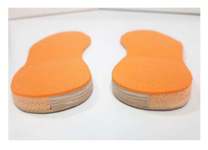
Figure 1. Novel supination orthosis made using 3 mm-thick ethylene-vinyl acetate and lateral cushioning casting filled with Poron.

All participants were recruited from a biomechanical clinic in Madrid, Spain, over a 3-month period (between September and November 2020). The following inclusion criteria were used to choose the participants: (1) healthy participants between 18 and 30 years of age, (2) recreational runners with a rearfoot-strike pattern who had been training for 3 to 4 hours per week for at least the past year, (3) neutral Foot Posture Index (FPI) (ie, values between 0 and