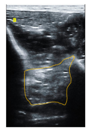
Figure 1. Ultrasound imaging thickness and CSA of the TP muscle. ( A ) Upper third of the imaginary line in a longitudinal view (thickness) and ( B ) Transversal view (CSA) to identify the TP.