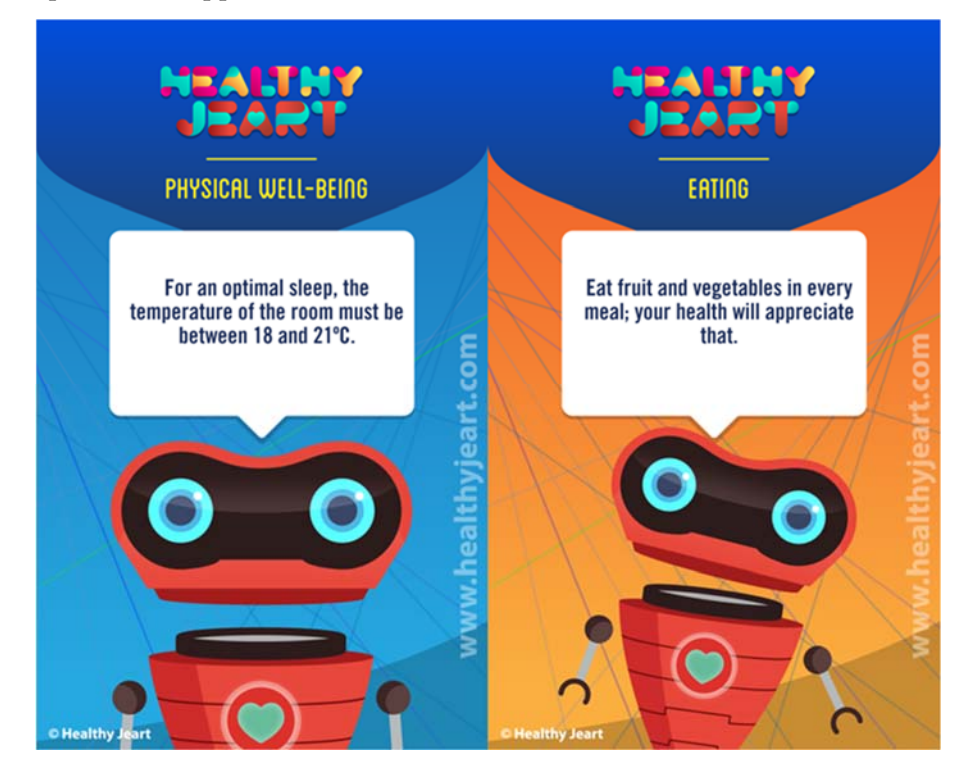
Figure 1. Examples of app tips.

Minors can find in it clear, brief, simple and understandable messages (called tips), with practical advice and suggestions, with a theoretical basis, on different areas of health. Young people aged 12–16 years have information about the following seven areas: physical activity (physical state, physical exercise, sport), eating (nutrition, food and drinks), physical well-being (sleep, personal hygiene and safety, time management), psychological well-being (self-esteem and self-concept, emotions, social skills), toxic substances and addictions (substances such as alcohol, tobacco, cannabis), affection-sex (sexuality, couple relationships, gender violence) and new technologies (use and abuse of technologies, social networks). Children aged 8–11 years do not have access to the areas on toxic substances and addiction and affection-sex. The aim is to help them expand their knowledge in every area, develop favourable attitudes and become aware of how they can improve their habits and adopt healthy behaviours. Experts in the corresponding areas have approved the tips of each of the areas. All of them have been written for children and young people, using strategies to help them remember, such as rhymes and jokes (in Figure 1 two examples of tips from the app are shown).