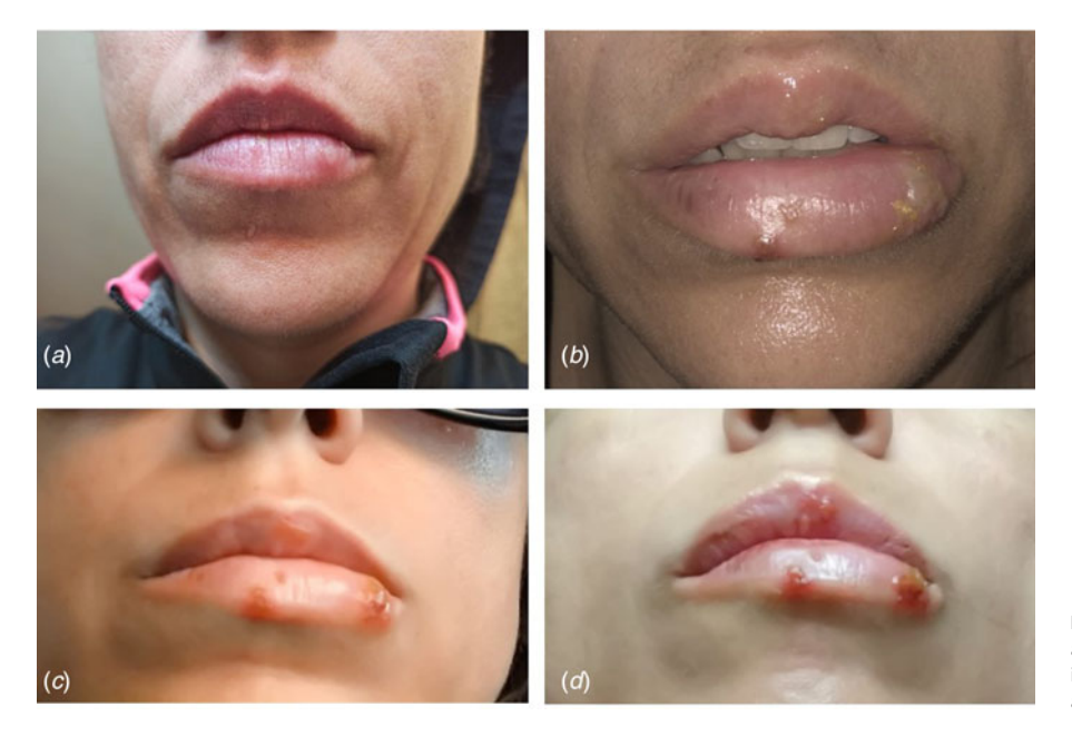
Fig. 2. Case 2. (A) Prodormal period with burning area and itching on the lower lip; (B and C) florid period of infection with increased number of vesicles on the lips and (D) referral period. Negative RT-PCR for SARS-CoV-2.

and decreased cardiac output with multi-organ damage [15, 17]. This altered immune response facilitates the replication of the virus and the increase in the viral load, by means of causing the NK cells and CD8+ lymph T cells to become exhausted and hence the coronavirus cannot be eliminated [18]. In the same way as occurs in other states of hyperactivation of the immune system, such as burn patients, polytraumatised patients and head trauma patients, the increase in adhesion molecules could generate a state of immunodeficiency of T and B lymphocytes which would remain attached to the endothelium of the blood vessels and therefore unable to enter the site where they should perform their function [19, 20]. In addition, the SARS-CoV-2 infection produces a reduction in the percentages of monocytes, eosinophils and basophils [2].