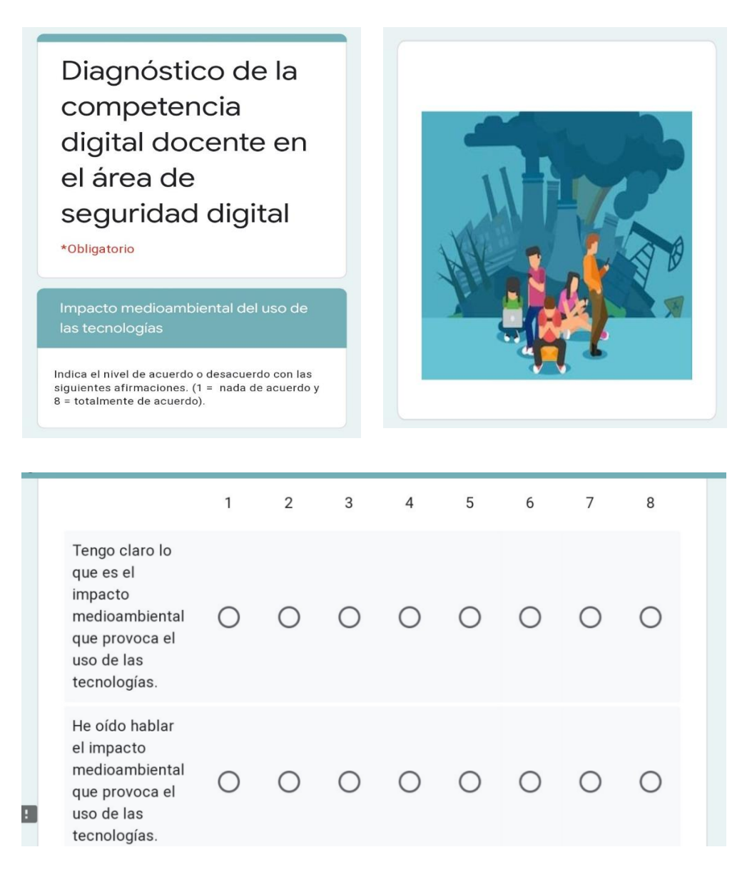
Figure 1. Digitized Google Forms questionnaire fragment.

After validation, the final questionnaire is adapted for online application through the Google Forms application (Figure 1) and applied in different centers of Early Childhood, Primary and Secondary Education of the Autonomous Community of Andalusia (Spain). Previously, the management of these centers is contacted by sending them, together with the informed consent, the objectives and the link to the questionnaire for dissemination among the teaching staff during the first quarter of the current year.