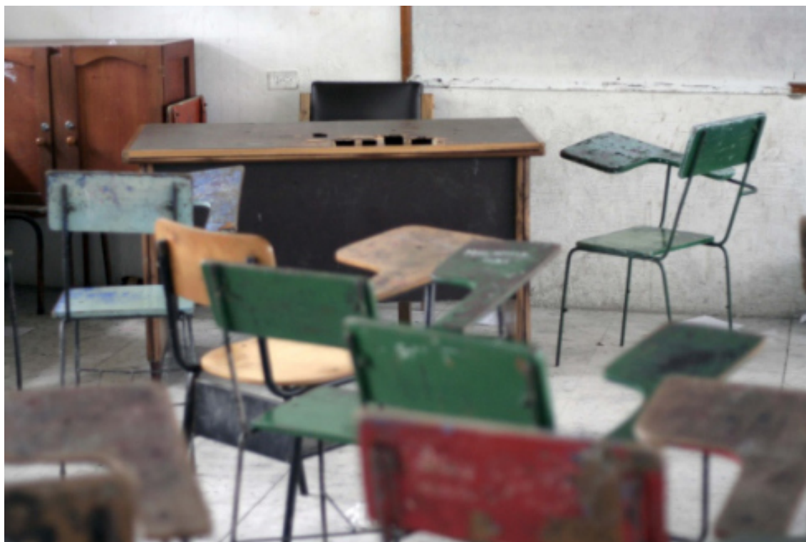
Universal access to quality education is central in the fight against child labor

Along these years of international cooperation with Colombia we have found that universal access to quality education is a central element in the fight against child labor. We are referring specifically to actions to prevent absenteeism and dropout, as well as to improve academic performance, ensure compulsory education and improve the educational system. In fact, the highest impact of child labor in academic performance seems to occur when the time devoted to child labor competes with the time devoted to school. That is to say, both the number of weekly hours spent at work, as well as making work activities coinciding with school hours, are the conditions that most negatively affect social and educational development of children.