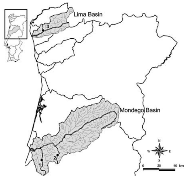
Figure 1. Map of the study area, showing the location of the Arunca (1), Corvo (2) and Estorãos (3) rivers. Mapa del área de estudio, mostrando la localización de los ríos Arunca (1), Corvo (2) y Estorãos (3).

The ruivaco Achondrostoma oligolepis (Robalo, Doadrio, Almada & Kottelat, 2005) is a small-sized (<150 mm TL) cyprinid endemic to Portuguese rivers. Its distribution covers the central and northern river basins of Portugal, occupying a great variety of lotic systems from cold-water and permanent streams to warm-water and intermittent watercourses (Ferreira et al. , 2007a). This species normally inhabits moderate to slow-flowing waterways with sandy or gravel substratum and aquatic vegetation and is generally considered tolerant to stream degradation (Santos et al. , 2004; Ferreira et al. , 2007b). It reaches sexual maturity in the second year of life and reproduces from April to June. There are studies that focus on the genetic variability (Robalo et al. , 2007) and spatial distribution of this species at different spatial scales (Ferreira et al. , 2007a), but none have addressed feeding ecology. This information could prove extremely useful for other small