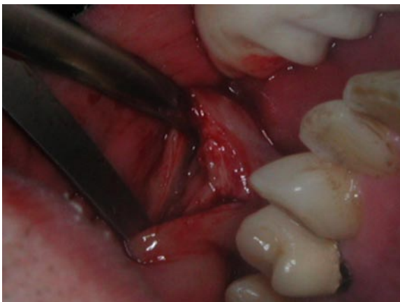
Fig. 2. The separation of the margins of the lesion favours the creation of a salivary fistula as a possibility for cicatrisation.