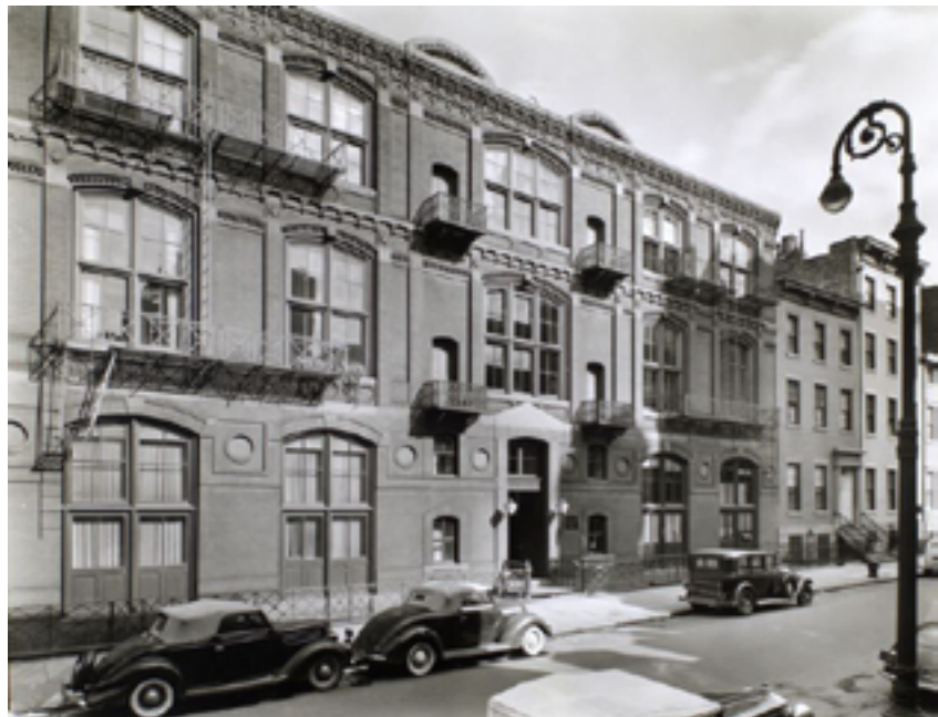
Fig. 03. The 1858 10th Street Studios Building, 51 West 10th Street. November 10, 1938.

Washington Place, was one of the epicenters for bohemianism in the first half of the twentieth century. 4