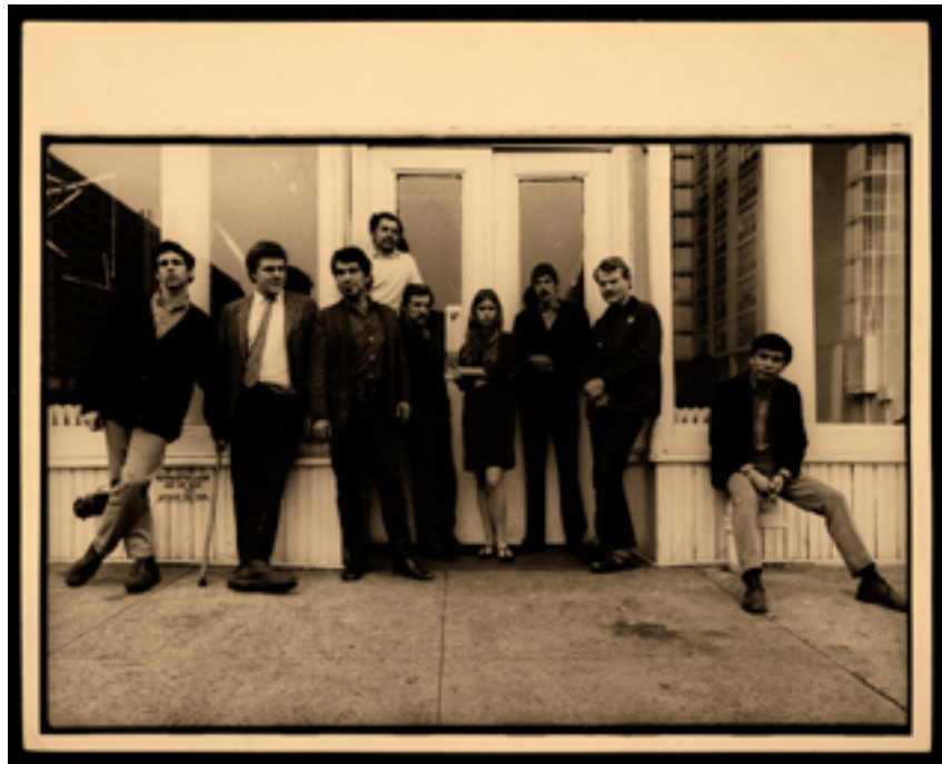
Fig. 09. Artists of Park Place Gallery, 1967 or 1968.

The use of alternative space for the artistic creation, the democratic management of the artistic message, the collaborative work or the sense of community, were some of the aspects related to the Tenth Street Co-ops that the artistic counterculture would develop in the following decades. Artists who belonged to those galleries moved on towards new projects that were to have a large impact in the city. This is clearly exemplified in the case of Mark di Suvero who, in 1959, from Tenth Street moved to Front Street near the Fulton Fish Market on South Street, closer to other artist node of the 1950s, the Coenties Group, and from there to Park Place in downtown Manhattan (fig. 09).