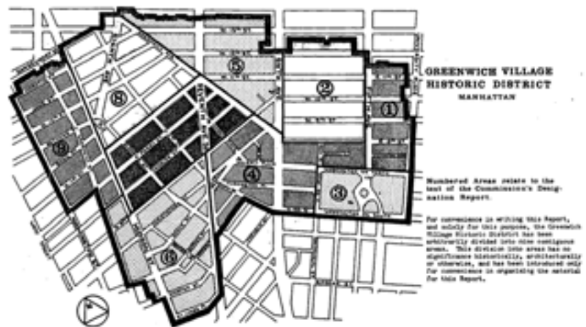
Fig. 01. Map from Greenwich Village Historic District Designation Report, New York, Volume 1, 1969.