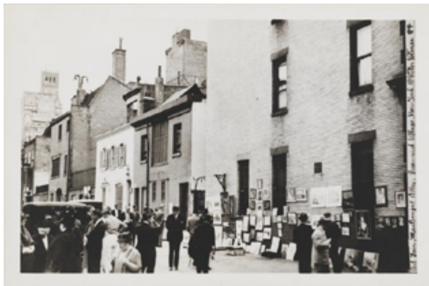
Fig. 02. Art Fair, MacDougal Alley, Greenwich Village, New York, 1930.