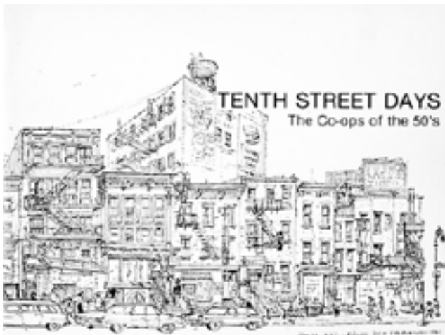
Fig. 06. Catalog of the exhibition Tenth Street Days: The Co-ops of the 50s, 1978. Ignored.