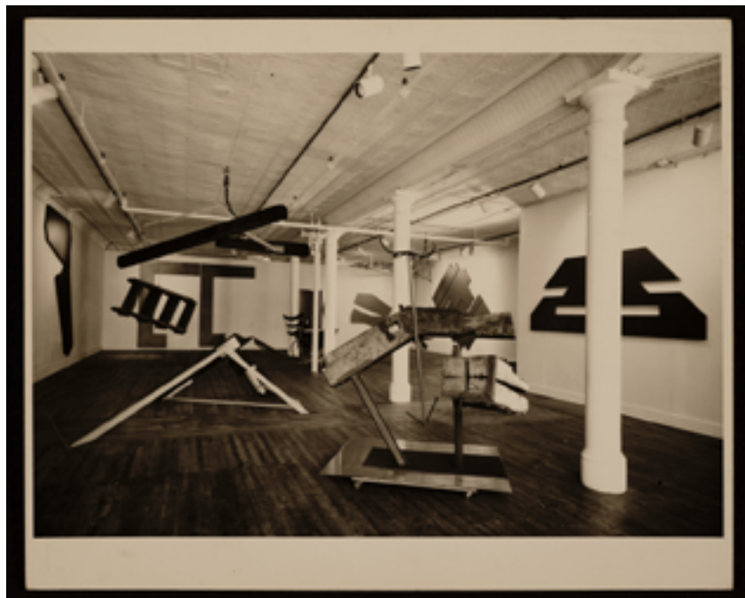
Fig. 10. Installation of Mark di Suvero and David Novros at the Park Place Gallery, Jan. 23 - Feb. 24, 1966.

ground-floor space in which they could exhibit their large, urban-scale works and stage performances.” 21