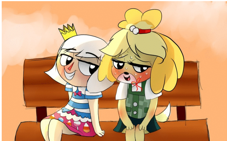
Figure 15. "Oh, mayor!"