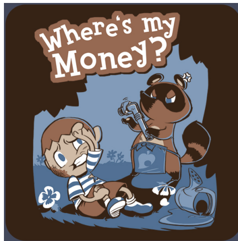
Figure 18. Tom Nook and the villager drawn by a fan