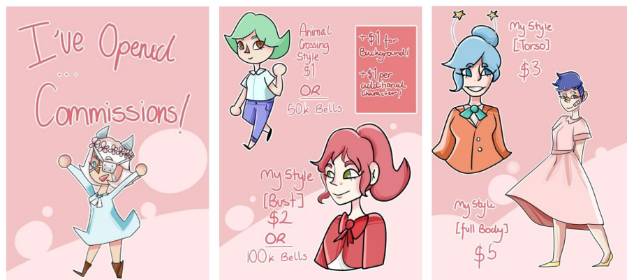
Figure 8. “Comissions! [Re Post]”