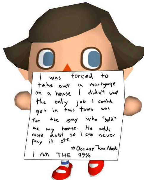
Figure 19. "Occupy Animal Crossing"