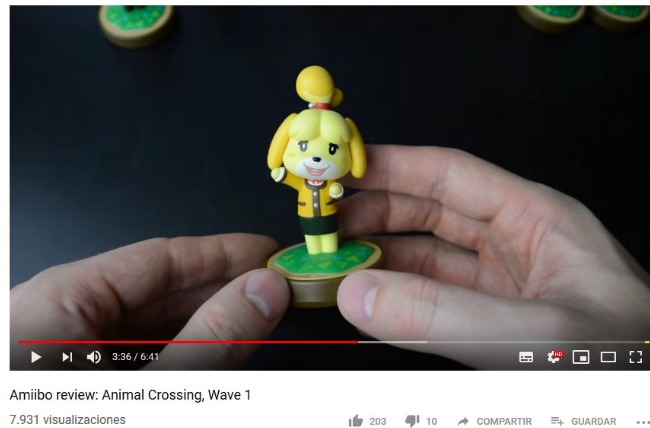
Figure 6. “Amiibo review: Animal Crossing, Wave 1”

Regarding the neoliberal and consumerist component of Animal Crossing, there are two fan videos that exemplify the reproduction of the economic ideology beyond the game. In the “Amiibo review” (figure 6), a fan comments some accessories of the game, an action which encourages others to collect them. “Animal Crossing Trailer (fan made)” (figure 7), is a fictional promotional video which was created using the ‘hype’ for the launch of Animal Crossing for Switch. These manifestations can be considered as fanadvertising, as far as they are non-official collaborations that promotes the brand.