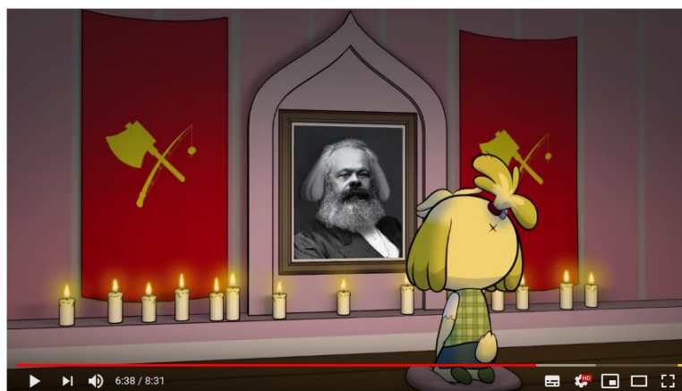
Isabelle Ruins Everything (Animal Crossing Parody)

Finally, fanart of Animal Crossing is not limited to drawings. The community also develops more elaborated pieces, like the video “Isabelle Ruins Everything (Animal Crossing Parody)” (figure 9). It is difficult to locate this piece in this category or in the challenge one. On the one hand, the video is a parody of Marxism and narrates what happened in the Animal Crossing village with the mayor left for one year and with a communist Isabelle in charge. But, on the other hand, it can be interpreted as a parody of the consumerism that governs Animal Crossing, when the mayor asks people to stop revolution because they do not need the “proletariat liberty” they are asking for. In this case, the mayor could be understood as the capitalist agent that comes to rescue the society from Marxism. The controversy is solved with the release of a butterfly as distractor element and the neighbours running to catch them. So, it could be interpreted from a critical Frankfurt School perspective as the role of the entertainment and cultural industries to maintain the status quo. Because of that it is ambiguous to classify.