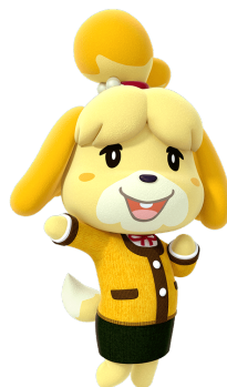
Figure 1. Animal Crossing's character Isabelle

Usually, the sexist representations of Animal Crossing are referred to Isabelle (figure 1), the secretary of the mayor. She is kind, efficient and considerate, and her good manners converted her in one of the most popular icons of the saga since the launch of Animal Crossing: New Leaf . With her popularity plenty of fans took her as 'waifu', a term used in fandom communities to design your favourite character of a manga or other content that you consider your wife. The masculine homologue is the 'husbando'. These fictional relationships promote fanciful fanart that in several cases is erotic or even pornographic.