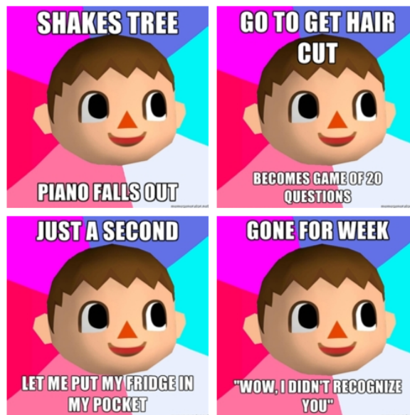
Figure 10. "Acnl Villager Memes"

Perhaps the less interesting fanart regarding the purpose of this research is the neutral one. Although there are pieces that reproduce the hegemonies presented in the game, there are plenty of them that do not interact with those power relations. Instead, these pieces just want to make humour regarding absurd situations of the game or making 'memes' re-signifying the content of Animal Crossing, as occurs in figure 10.