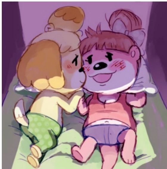
Figure 16. Isabelle and Lottie drawn by 'Computer Garden' independent artist