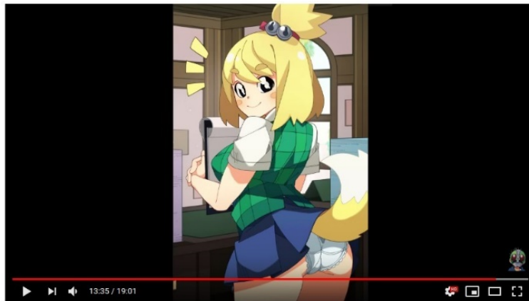
Animal Crossing - Isabelle Fan Art

More impressive is the fanart "Isabelle Alt" (figure 3) that represents a situation of rape or BDSM. The tied Isabelle with her attributes exaggerated reify her body and present her as an object. In this case other fans have been more forceful rejecting the image.