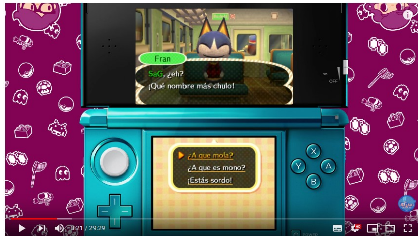
¡MALDITA ALCALDESA NEOLIBERAL!: Animal Crossing New Leaf para 3DS #JugamosaDobles #LaVenganzaDeLeven