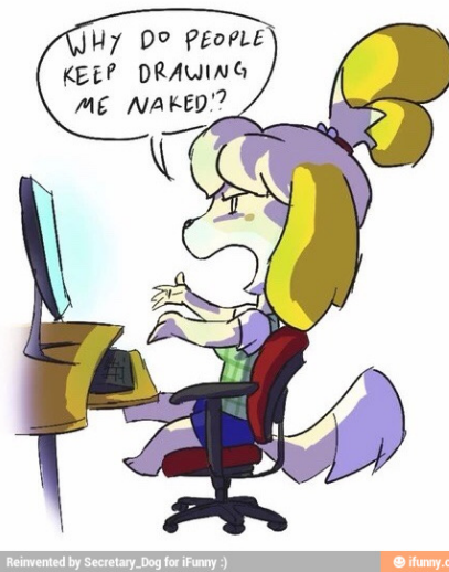
Figure 11. “Why people keep drawing me naked?”

Source: KnowYourMeme (author: Kazenoabs0).