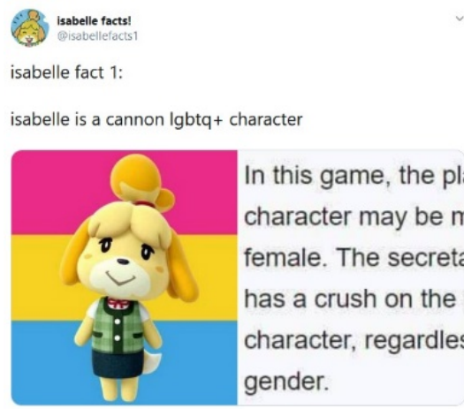
Figure 13. "Isabelle fact 1"