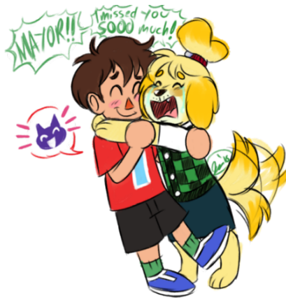
Figure 4. "Super Smash Brothers Ultimate – Isabelle and Villager reunited"

For its part, in "Animal Crossing: Gender Glitch" (figure 5) it is recognizable a situation that happened to a player of New Leaf . The user received a dress from a neighbour, and he found it extraordinary because his character is male. Thus, the user uploaded it to YouTube and tagged it as a glitch, considering that receiving a dress if you are a boy is nothing but a computer error.