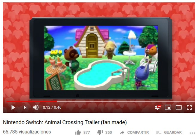
Figure 7. “Nintendo Switch: Animal Crossing Trailer (fan made)”

It is worth to comment the ‘commissions’ procedure that some fans carry on (figure 8). They offer drawings in Animal Crossing style that can be payed in Animal Crossing bells. This is interesting because it is a way of expanding the economic relations of the game beyond the canonical text. As it was reviewed before, the entrepreneurial component is in the Animal Crossing functioning, but fans can interact with it by reproducing it.