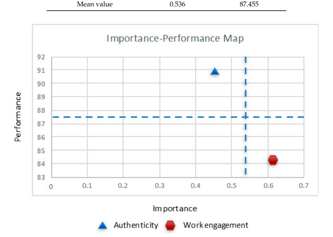
Figure 3. Importance–performance map.

In our paper, the IPMA technique provided interesting results. Since the WE construct was paced at the lower-right quadrant, this implies that it scored over the average in terms of importance and under the average in terms of performance. Thus, work engagement is the aspect that should be prioritized. This result is in line with the mediation effect hypothesized and supported by PLS analysis that entails that authenticity is a significant driver of subjective wellbeing, but only to the extent that it leads to work engagement. In other words, only when authentic behavior contributes to raise the individuals' levels of work engagement will it subsequently lead to increasing their perceived subjective wellbeing.