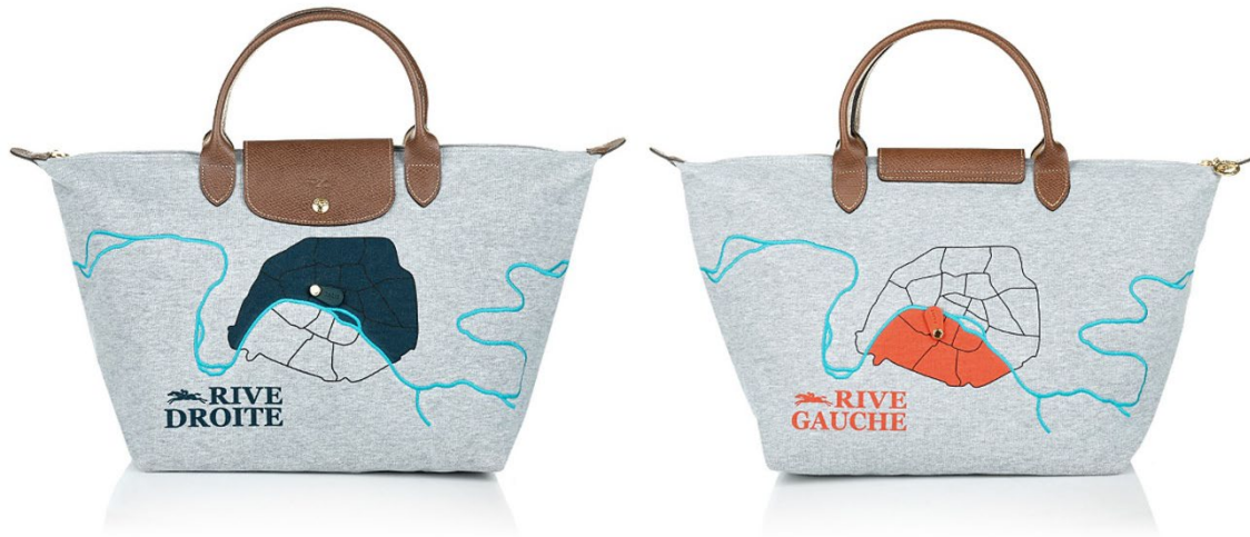
Figure 1. ‘Longchamp 2014 Collection: Le Pliage Rive Droite et Rive Gauche ’. The imagery of the two banks in which the city is divided compose a strong and differentiated identity of Paris. This can be found in various manifestations such as this Longchamp bags

With its historical central piece, the City Island, the two great halves in which Paris is divided, the Rive Droite (the Right Bank) and the Rive Gauche (the Left Bank) make up two conflicting visions of the city, developed in different times on either side of the river and with very different identities (Figure 1). This binomial, in which the border is the river, assumes its limit as an element of cohesion and meeting point for the city, incarnating the places of power, which, after the revolutionary stages, will turn towards the embodiment of an urban cultural focus, composed of the sum of multiple and successive museum and cultural institutions.