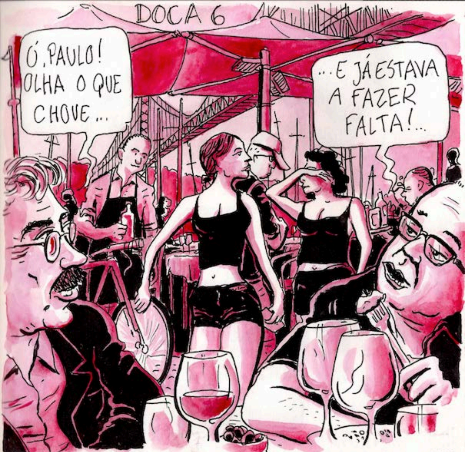
THE LAST OF THE MOHICANS - ON THE LOOK OUT