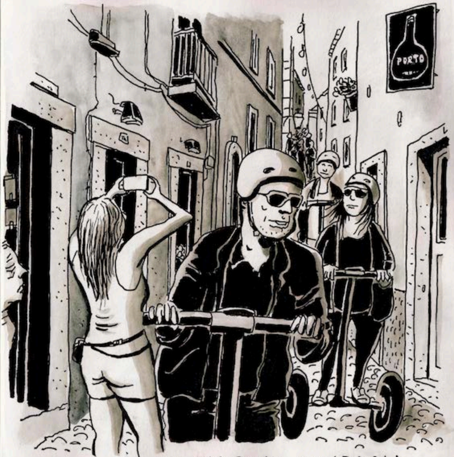
ROLLING DOWN MOURARIA