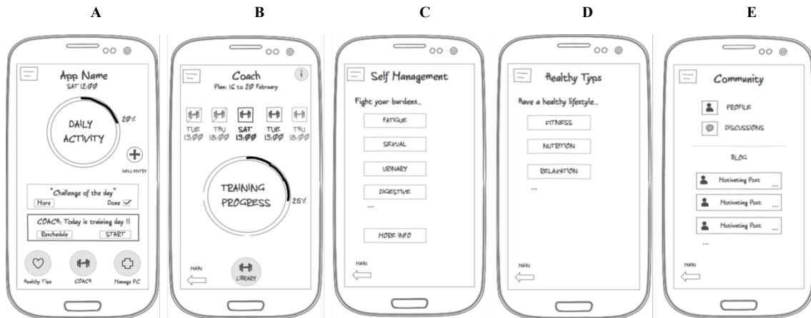
Figure 3: The main screens of the prototype interface. Screen A: includes important information of the current day as well as access for information on healthy tips and self-management; it shows the daily physical activity with the progress bar, allowing users to register any activity they take during the day with the ‘New Entry’ button; clicking the progress bar will take the user to a page with previous activity; the screen also includes one box with a daily challenge and another with a training reminder. Screen B: the ‘Coach’ screen with the proposed plan of training and access to the library of exercises; if the user clicks the icons over the schedule, it will take him to a training screen that starts with an explanation of the routine of exercises; progress in the overall training plan is shown with the progress bar. Screen C: the ‘Self-Management’ screen includes the documentation for managing the different possible health burdens. Screen D: the ‘Healthy Tips’ screen includes documentation with information on healthy lifestyle. Screen E: the ‘Community’ screen includes the option to create a profile, a discussion section and section for motivating blog posts.