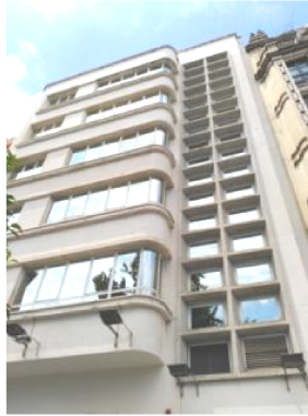
Fig. 1 Offices Building “José Ibarra y Lasso de la Vega” (Juan-Andrés Rodríguez-Lora)

buildings built in the past century with ornament and decoration on their facades or they were built with historicist style. In these cases they usually have greater recognition by the society (Capitel, 2011:82) and better protection by the public administrations. The lower recognition of modern architecture shows the need to diffuse and transmit the importance of architecture without ornament that was built in the last century as historical legacy of future generations.