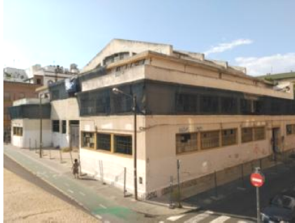
Fig. 3 Marketplace "Puerta de la Carne" (Juan-Andrés Rodríguez-Lora)

This case serves as an example of the need for better tutelage and the previously noted importance of being used. Although it is included in the General Catalogue of Andalusian Heritage since 2008 and the special protection plan of its sector classify it as B level, is in danger due to its poor state of conservation.