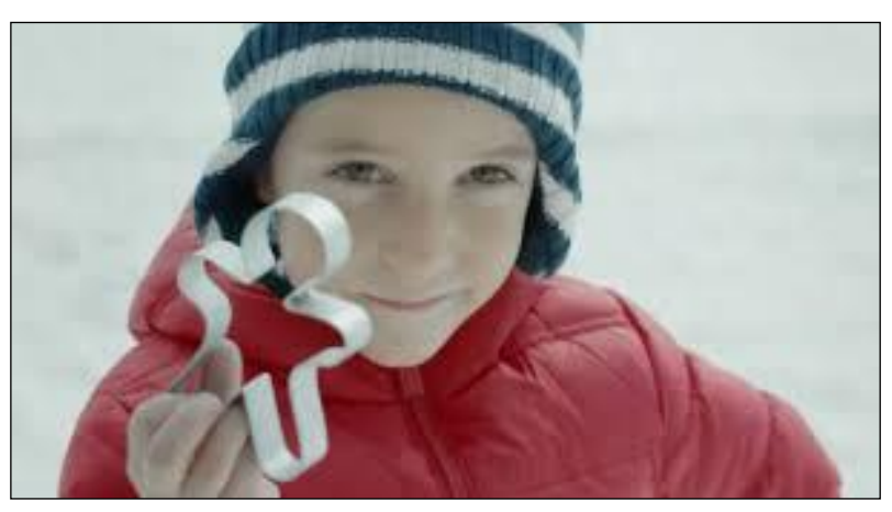
Image 6: Frame from Ikea's "Christmas deconstructs our heads" commercial

From: at https://www.youtube.com/watch?v=70qaoR6rSWM. Day of consultation: April 30, 2018