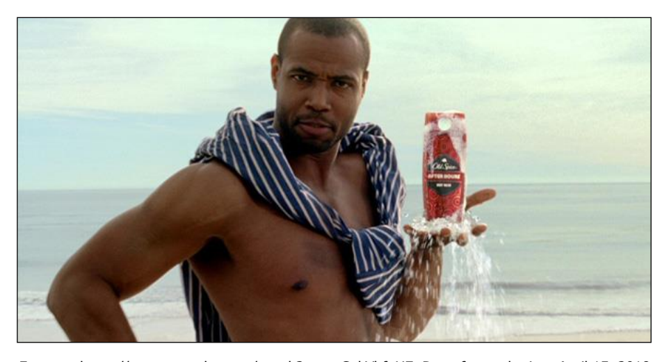
Image 5: Frame of Old Spice's "The man your man could smell like" commercial, created by the agency Wieden & Kennedy

From: at https://www.youtube.com/watch?v=owGykVbfgUE. Day of consultation: April 15, 2018