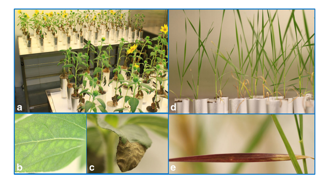
Fig. 1 Pot starvation experiment: a sunflower in growing chamber with b incipient P deficiency symptoms and c clear deficiency symptoms and d wheat with e P deficiency symptoms

The wide range of P_{CaCl2} threshold values observed supports the contention that the P concentration in soil solution above which there is a sufficient P uptake by plants varies widely depending on soil properties, consistent with previous results (Sánchez-Alcalá et al. 2015). These values were affected negatively by active calcium carbonate, and positively by Fe_{ca}/Fe_d , and hydrolysable organic P in NaOH and citrate-bicarbonate extracts (Table 2; Fig. 3). This reveals the potential contribution of organic P to P supply to plants. The effect of the ratio Fe_{ca}/Fe_d on threshold P_{CaCl2} can be explained by the lower affinity of P for poorly relative to highly crystalline Fe oxides. This implies that a higher P concentration in solution can be in equilibrium with the