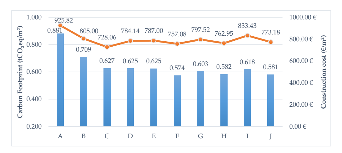
Figure 2. Carbon footprint and costs per area for the 10 selected case studies.

From the analysis of the ten selected typologies described in Table 3, the results obtained by the OERCO2 tool are shown in Figure 2, both in terms of costs ( {\it E}/{\it m}^2 ) and CF ( {\it tCO}_2{\it eq}/{\it m}^2 ). It can be observed that there are no notable differences between the results for these typologies, except for A and B, which correspond to single-family houses with one or two floors without a basement where the incidence of construction materials and machinery is higher. Thus, statistical studies are complicated since these typologies are less uniform than residential buildings. This causes significant differences even among typologies with the same number of floors. It is also worth mentioning the difference in results between typologies with and without underground floors. Underground floors are taken into account to express results per {\it m}^2 ; however, the presence of finishes is much lower than in floors above ground, which decreases the economic and environmental impact per {\it m}^2 . Typologies C to J show small differences, but a decrease in the environmental impact in taller buildings is observed, e.g., typology F (4 floors above ground and 2 underground) produces less environmental impact than typology G (5 floors above ground and 1 underground).