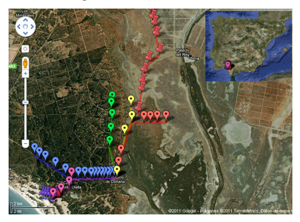
Figure 1: Google map of Biological Reserve of Doñana. Blue route from Palacio to Matalascañas route ended around Ojillo. Pink route from Palacio to Dunes. Purple route on Dunes. Green and red routes on Humedales.

through XBee. Once the software application is running, it sends a broadcast packet asking for mote discovery, and then it keeps waiting for answers. When at least one mote have been discovered, and using a software timer, the first mote will continuously be transmitting information using a point to point link to the just discovered mote, transmitting one packet per second. Furthermore, the XBee transceiver is able to make remote AT commands request, this feature is used by tower mote for requesting information about the power of last received radio packet for each timer overflow. Power radio reception measurement is returned to tower mote as a dB magnitude. Thank to the use of application software, we can characterize the quality and radio power of the transceiver links for the Doñana Biological Reserve scenario.