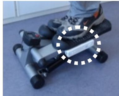
Figure 3: An example of a WiiRemote monitoring a fitness device.

This group comprises sensors like computerized fitness devices, electronic pedometers, mobile phones [14], video cameras, and video-games motion controllers.