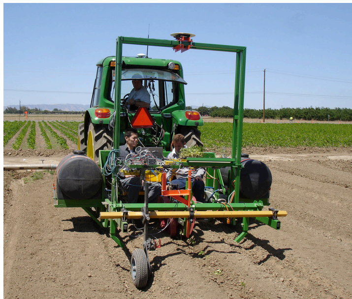
FIGURE 1: Photograph of the RTK-GPS automated transplanter mapping system being used to plant tomato transplants on the UC Davis campus farm.

A field test was conducted during the spring of 2011 using processing tomato transplants as the target crop. The field site was located at the Western Center for Agriculture Equipment (WCAE), on the University of California, Davis campus (Latitude: 38.53894946 N, Longitude: 121.7751468 W). In this test, sixteen rows were planted (single crop row/bed, 1.5 m bed spacing) with an improved version of the GPS mapping transplanter described by Sun et al. (2010). The transplanter was operated at a ground speed of 1.6 km/h using rows that were laid out in a predominantly East-West direction. The transplanter sled was pulled behind a tractor steered by an RTK GPS autoguidance system (model EZ-Guide 500, Trimble Navigation Ltd., Sunnyvale, CA, USA). All seedbed preparation operations were also conducted with a tractor steered by GPS autoguidance using a common set of GPS AB line