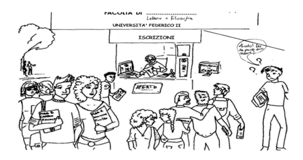
Fig. 1. One of the six vignettes: enrolment in University courses

During the phase of the Narrative Input, each participant was provided with a set of six vignettes. The students were asked to choose one of the protagonists in each vignette, to draw a blank bubble, to put themselves in the protagonist's shoes, and finally to write in the bubble what the protagonist is thinking or saying in that situation. The NGT asked each participant to read out loud what he/she had written in the series of six vignettes, with the aim of creating a story, helping the students to identify different states of mind associated with each vignette; and to use the vignettes to find some continuity between the six narrations, giving a coherent meaning to what they wrote (Narrative Construction of the Experience).