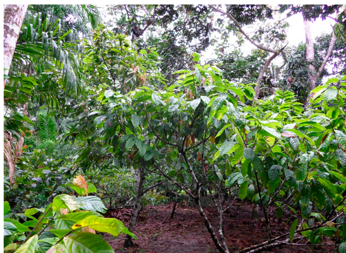
Figure 2. Cocoa trees, shade trees and the different heights of the chakra .