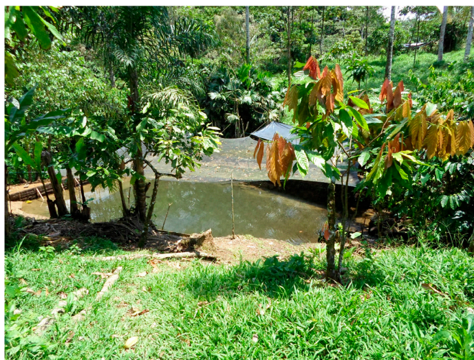
Figure 4. Aesthetic elements of the chakra .

inform the traditional Kichwa cosmology are essential in the construction and management practices of the chakra .