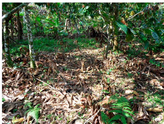
Figure 3. Maintenance of soil fertility based on nutrient recirculation.

Considering the characteristics of Amazonian land, e.g., the shallowness of the fertile soil layer and the deficiencies of certain nutrients, soil management is an essential element in the search of sustainable agricultural practices. Trees have three principal functions. Firstly, because an equatorial forest has a high capacity for the production of organic matter, trees provide much of the organic matter that breaks down and acts as an element of nutrient fixation in the soil. Thus, trees provide the closure of the material and nutrient cycles in the soil. Pruning rests and fallen leaves are also used for this purpose (see Figure 3). Secondly, trees capture inorganic nutrients from deeper soil layers and introduce them into the vegetation cycle, thus enriching superficial soil layers [30]. Finally, trees prevent erosion and the loss of the thin fertile soil layer.