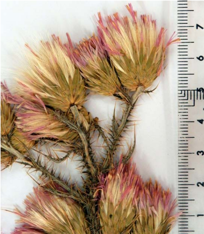
Figure 1. Carduus ibizensis (Devesa & Talavera) Rosselló & N. Torres: Detail of specimen UIB 16323.