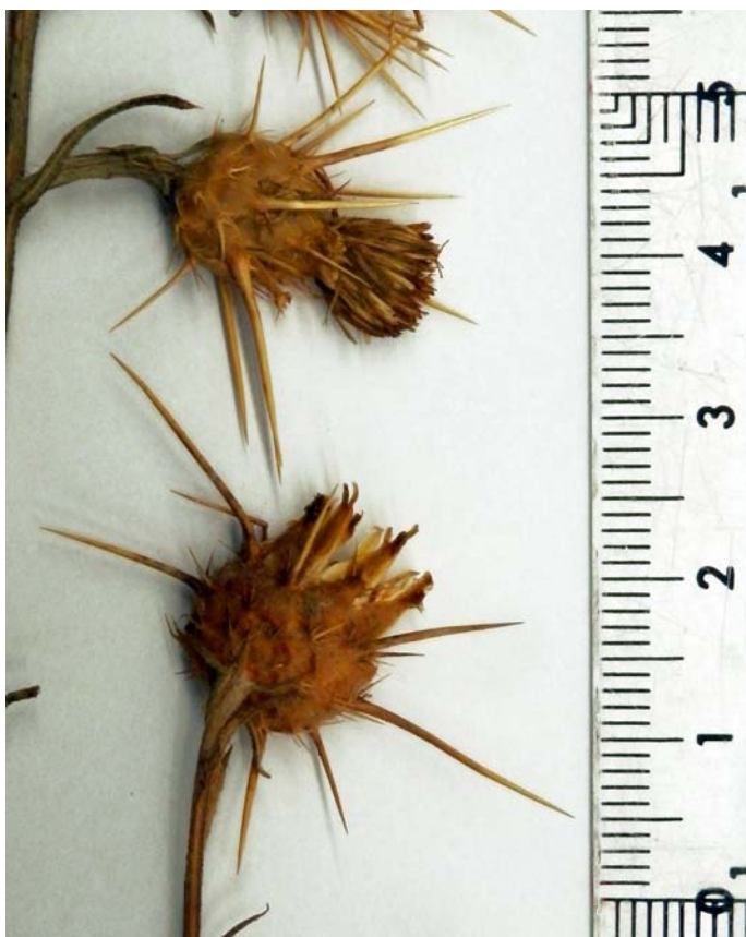
Figure 2. Centaurea solstitialis L.: Detail of specimen BCN 43603.

This species is not listed by Devesa & López (2013) for the Balearic archipelago. The dot in the map by Font & Vigo (2008) is based on this specimen without further comments. The voucher specimen is undoubtedly referable to C. solstitialis by its subglabrous or puberulent bracts, with the apical spine up to 16 mm long (Figure 2).