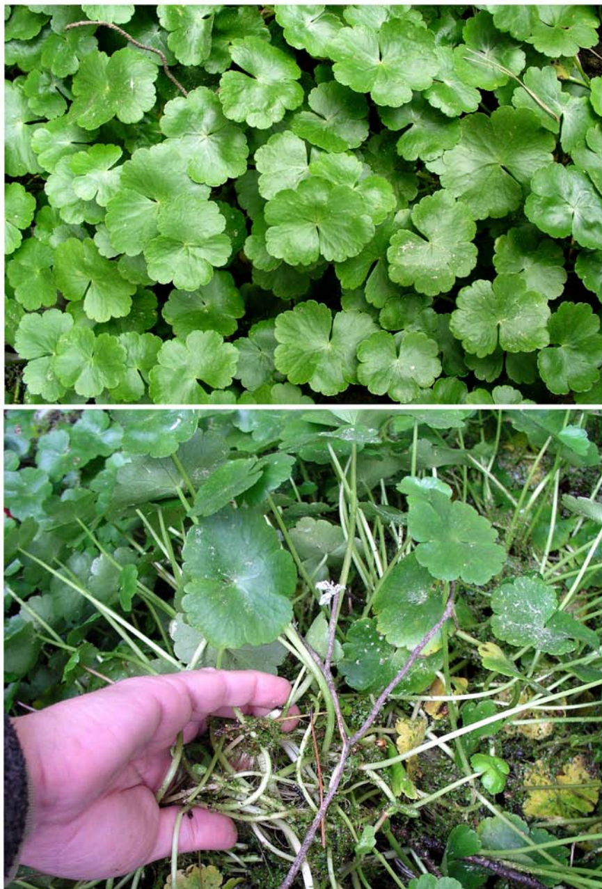
Figure 3. Hydrocotyle ranunculoides L. f.: Specimens from Banyalbufar.