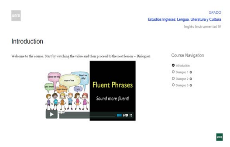
Fig.5. Explanatory video on the use of 'cup of tea'.

Then students can listen to each of the phrases inserted in a sentence at normal speed. Students are explained how to use each of the phrases.