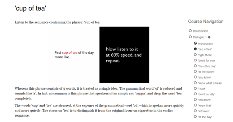
Fig. 7. Use of the slow-down technology with 'cup of tea' (60% speed).