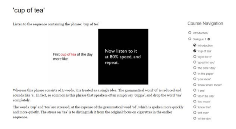
Fig. 8. Use of the slow-down technology with 'cup of tea' (80% speed).