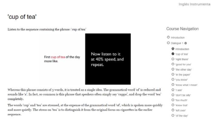
Fig. 6. Use of the slow-down technology with 'cup of tea' (40% speed).

Once students understand the dialogues, they can listen to each phrase slowed down to 40%, 60% and 80% speed thanks to the slow-down technology designed by DIT. This slow-down facility allows them to study the intonation patterns which characterise the way these phrases are uttered.