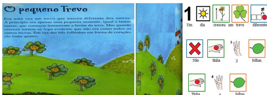
Figure 1: Example of adaptation of one children's story.

The goal was to help children to keep attention, understand the main concepts of the story, boost their initiative to communicate, and improve the quality and quantity of their communication. Children with difficulties in verbal comprehension and expression were provided with both the verbal label and visual representation of the concepts (multimodal language). Some of the adapted activities were provided in paper format, others in digital audiovisual format, and others used laminated images and signs with Velcro added, to ensure the durability of material and promote child interaction and participation. Whenever the activity involved handling signs (building sentences, organizing a narrative structure, etc.), children were given clear verbal and visual guidance.