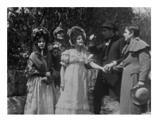
Figure 5. Outside locations in The Cricket on the Hearth .