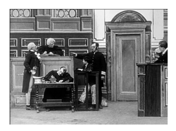
Figura 6. Large distance between camera and actors, and painted backdrops in Oliver Twist .

Whether modern techniques of editing, camerawork, acting and lighting are properly combined in The Cricket on the Hearth , the same cannot be said about Oliver Twist . The film presents nineteen self-contained scenes, most of them introduced by an explanatory title. Like in The Boy and the Convict , the camera remains static. The large distance between the camera and the stage impedes the audience from perceiving the actors' facial expression, but an attempt to convey a more natural acting is done. Here again, the film uses painted theatrical-style backdrops for interior scenes, with some real furniture mixed in.