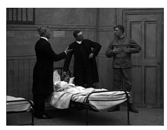
Figure 2. A prisoner's confession reveals the convict's innocence.

While in Great Expectations Magwitch is captured —although he escapes again later—, in The Boy and the Convict he escapes from the very beginning. This decision accelerates the time of the story and drives out other events present in the novel. Whereas he is also arrested by the end of the film, a major turning point takes place: a prisoner's confession reveals Magwitch's innocence. He is finally released and allowed to go back home (Aylott, 1909: [10:07-11:08]).