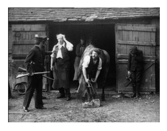
Figure 1. Opening of The Boy and the Convict . Two officers ask for the blacksmith's help.

The inciting incident of both the novel and the film is the convict's escape. However, Great Expectations opens with the powerful image of the tombstone of Pip's parents, in the churchyard at the marshes. There, Magwitch threatens him with death if he does not bring him some food and a file. No more information about the convict is provided until he is captured and the officers request Mr. Gargery's aid. On the contrary, the film opens with two officers asking for the blacksmith's help (Aylott, 1909: [00:14-00:26]).