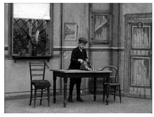
Figure 4. Painted theatrical-style backdrops in The Boy and the Convict.

As the camera never gets close to the characters, the stage distance makes it difficult to capture the facial expression of the actors. Consequently, they gesticulate exaggeratedly, use old resources as pointing at some direction to indicate where the convict has escaped, or look directly to the camera. In general, the film is full of excessive pantomime reflected in continuous shaking of hands, exuberant movements of arms and stagey soliloquy. Yet another criticized aspect has been the setting. During this period, the production companies increased revenues and they replaced the earlier open-air stages and cramped interior studios by larger studio buildings. These new studios combined sunlight and some kind of electric lighting, as well as incorporated three—dimensional settings. Nevertheless, The Boy and the Convict still uses painted theatrical-style backdrops for interior scenes, with some real furniture mixed in. The result is a lack of perspective that undermines the sense of reality.