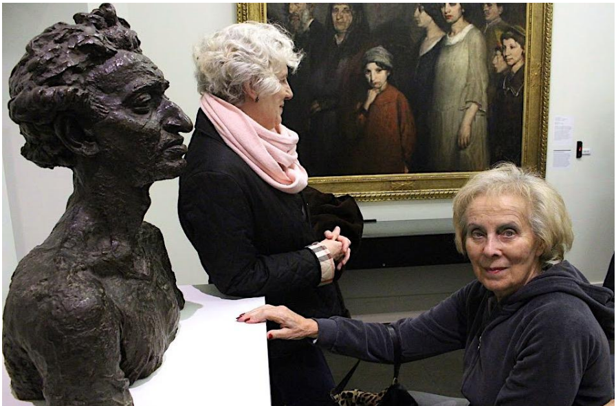
Figure 1. Participants enjoying a visit to 'Out of chaos: Ben Uri, 100 Years in London', 2015.