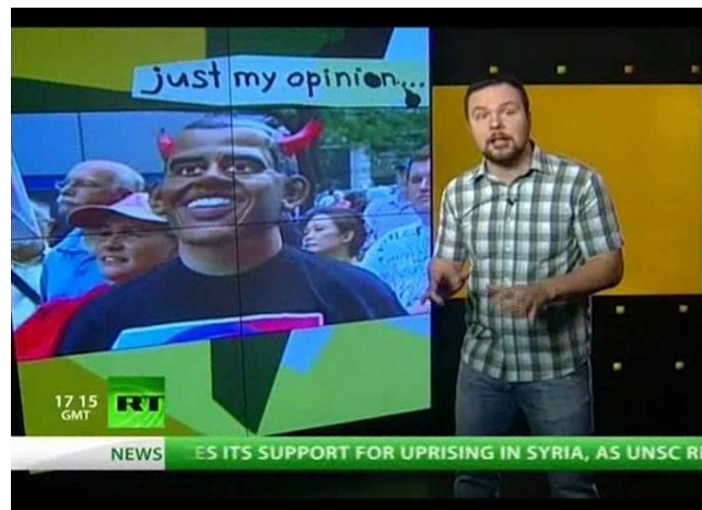
Messaging on RT prior to the US presidential election (RT, 3 November)