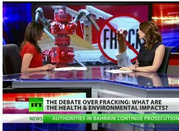
RT anti-fracking reporting (RT, 5 October)