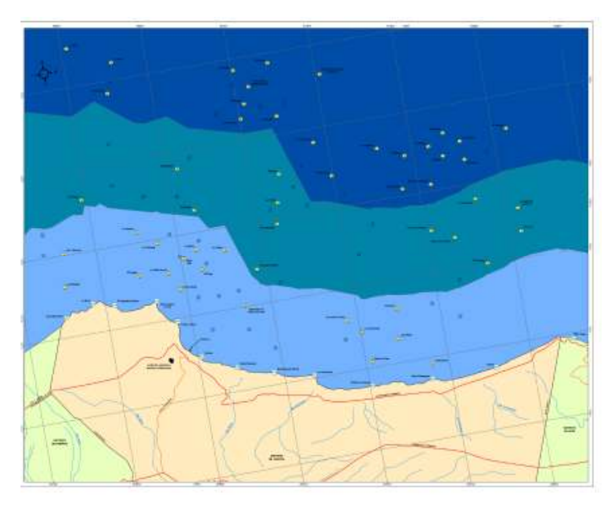
Figure 2. The three fishing areas in Lobitos. The three stripes represent the shore, the center and "outside", using the terminology of the fishermen. Yellow circles indicate fishing spots according to informants. Squares are oil platforms.