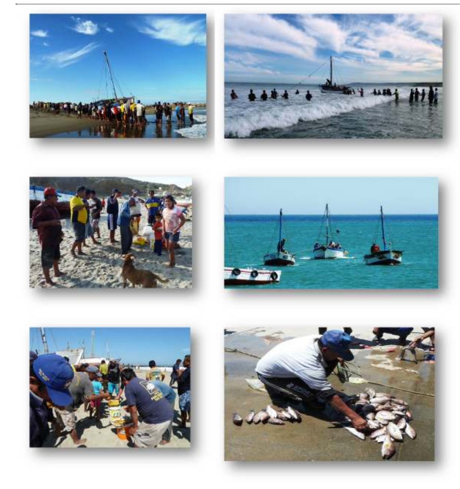
Figure 3. Collaboration between fishermen. From left to right and from top to bottom: boat stranded to land; boat launched into the sea; offering bread and coffee; damaged boat trailer; lunch provided by the aid received; distribution of the catch of the day.