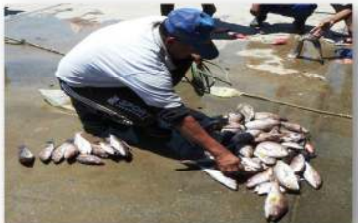
Figure 3. Collaboration between fishermen. From left to right and from top to bottom: boat stranded to land; boat launched into the sea; offering bread and coffee; damaged boat trailer; lunch provided by the aid received; distribution of the catch of the day.