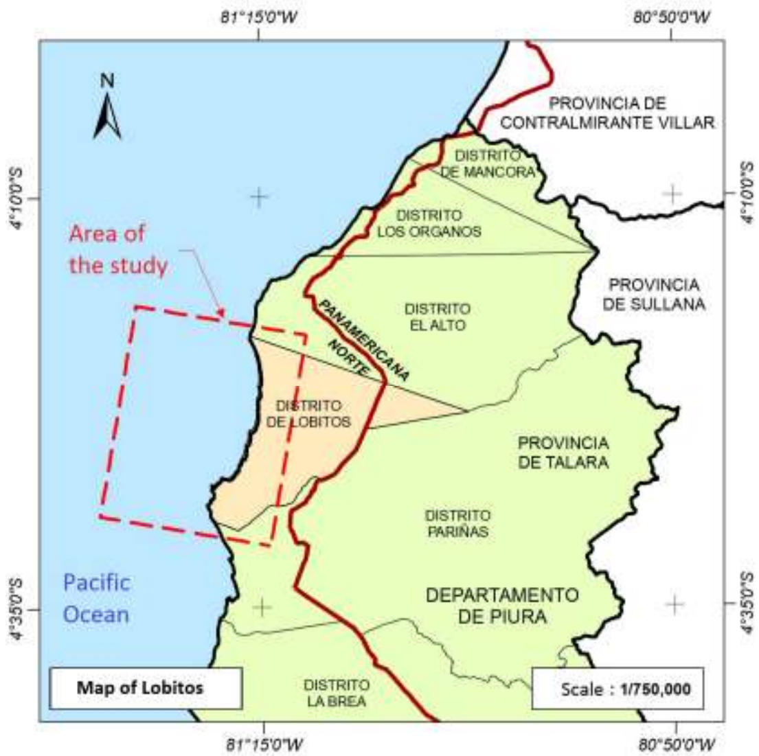
Figure 1. Study area: Coast of Lobitos in the province of Talara (Peru).