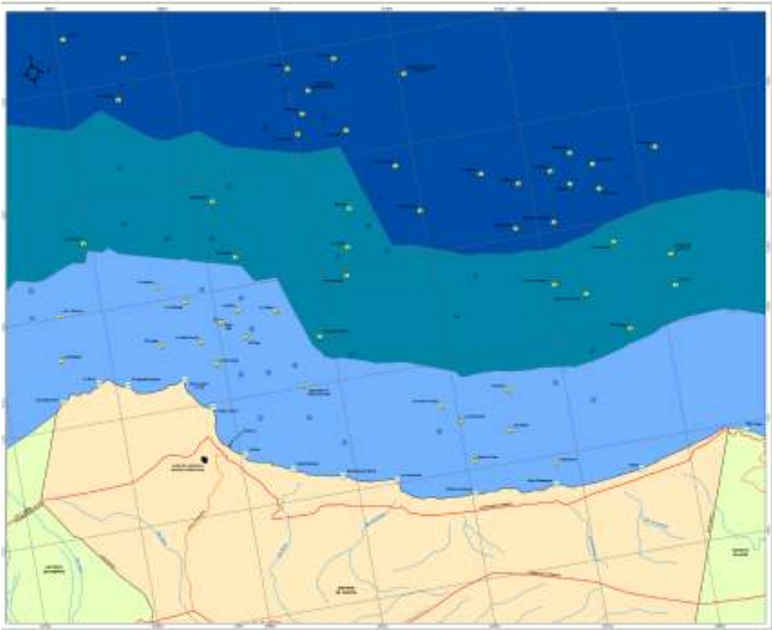
Figure 2. The three fishing areas in Lobitos. The three stripes represent the shore, the center and "outside", using the terminology of the fishermen. Yellow circles indicate fishing spots according to informants. Squares are oil platforms.