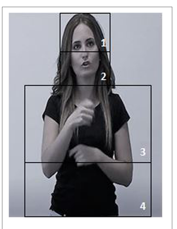
FIGURE 2 | Interest areas on the signer's body: 1 = Upper face; 2 = Lower face; 3 = Upper body; 4 = Lower body.

Next, we focused solely on the group of deaf students. Comprehension performance (percentage accuracy) was