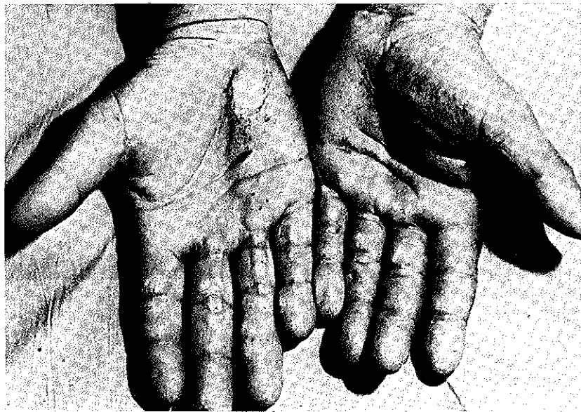
Fig. 2. Keratose striata, elements on the palms.

Although our results with oral and topical retinoid acid therapy have been satisfactory, both on the palms and on the soles, we feel that it might