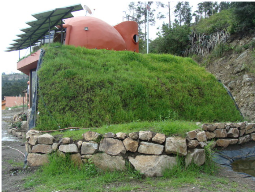
Fig. 9 Vegetal covering in one of the facades.