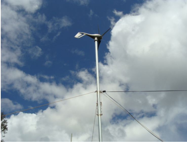
Fig. 11 Wind turbine