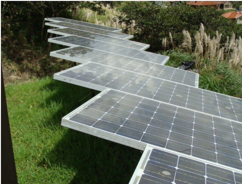
Fig. 12 Solar panels

In detail the house electrical generation system is a hybrid, which means that is composed by a photovoltaic system plus a wind system, that is constituted by a 500 watts' wind generator with three blades, (a triaspa), the diameter of the Asp is 1.5m.