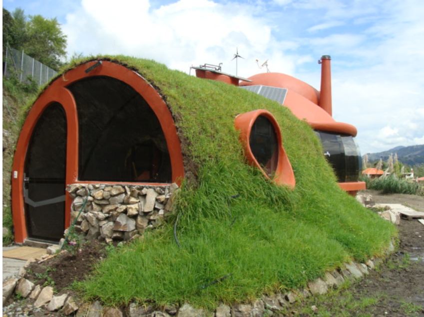
Fig. 8 Vegetal covering in one of the facades.