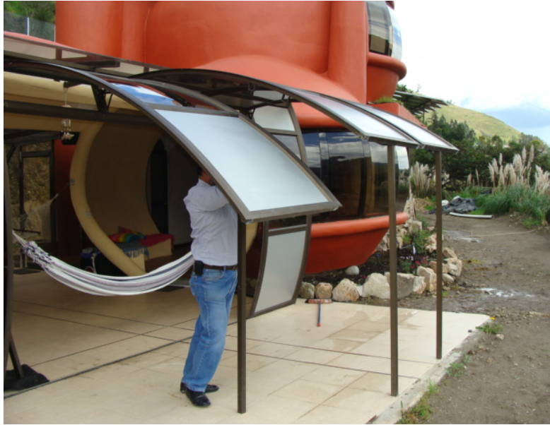
Fig. 6 Casement window