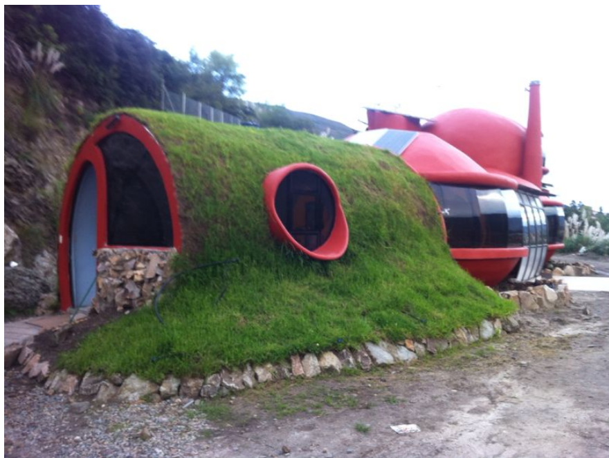
Fig. 4 House result