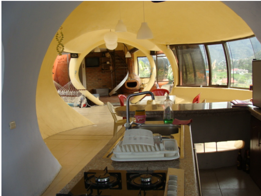
Fig. 5 Double curvature

The construction technique is ferrocement, and consists of 10mm cross section rods with a 2400 kg /cm 2 yield strength , with plaster meshes receiving a 1-3 mortar in layers of approximately 2 cm on each side and two layers of elastomeric paint.