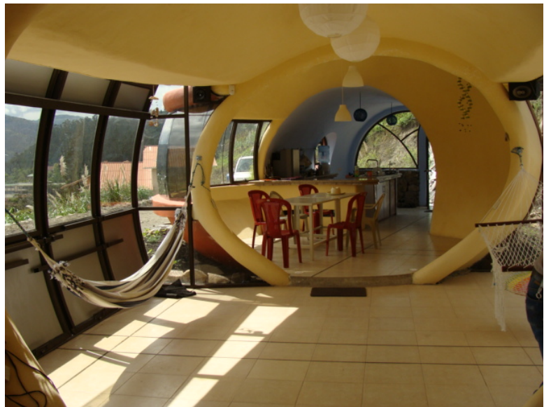
Fig. 7 Interior view