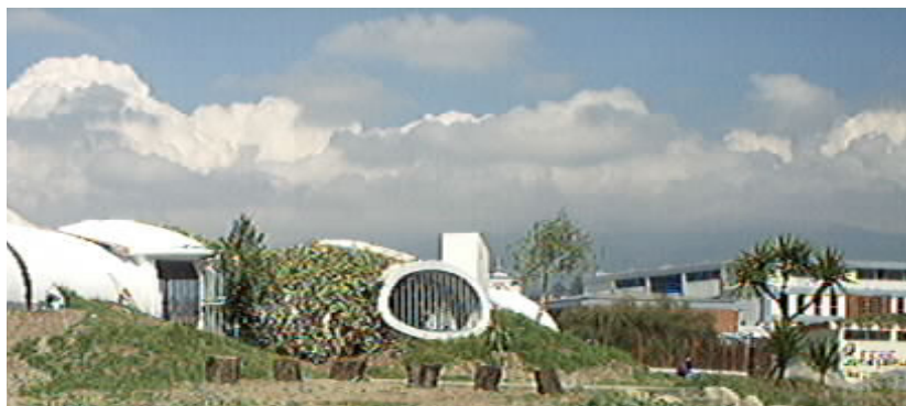
Fig. 1 Project "Cascarones" with vegetal cover at the Universtity of Cuenca

To complete sustainability goals its necessary to consider the human well-being, which also includes emotional aspirations. The owners are two scientists, an Ecuadorian master engineer specialized in wind, photovoltaic systems, sustainability and energy saving. The other owner is an Italian expert engineer in agricultural bioculture without chemicals, the perfect combination to achieve the best results. They already have a house in Cuenca city, near the universities where they are professors. That house is made of adobe, but advised by the architect (this article's author) they considered something different for their weekend house. After seeing a project built by the author, a shell construction of experimental concrete and vegetal covers, they decide to build their house based on this concept. The shell construction was part of an investigation done in the University of Cuenca a couple of decades ago.