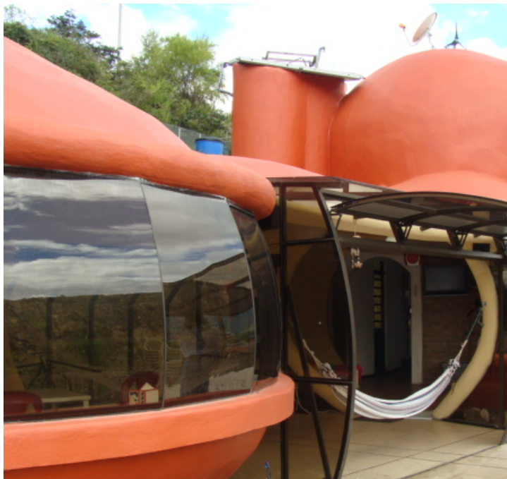
Fig. 11 Solar collector location