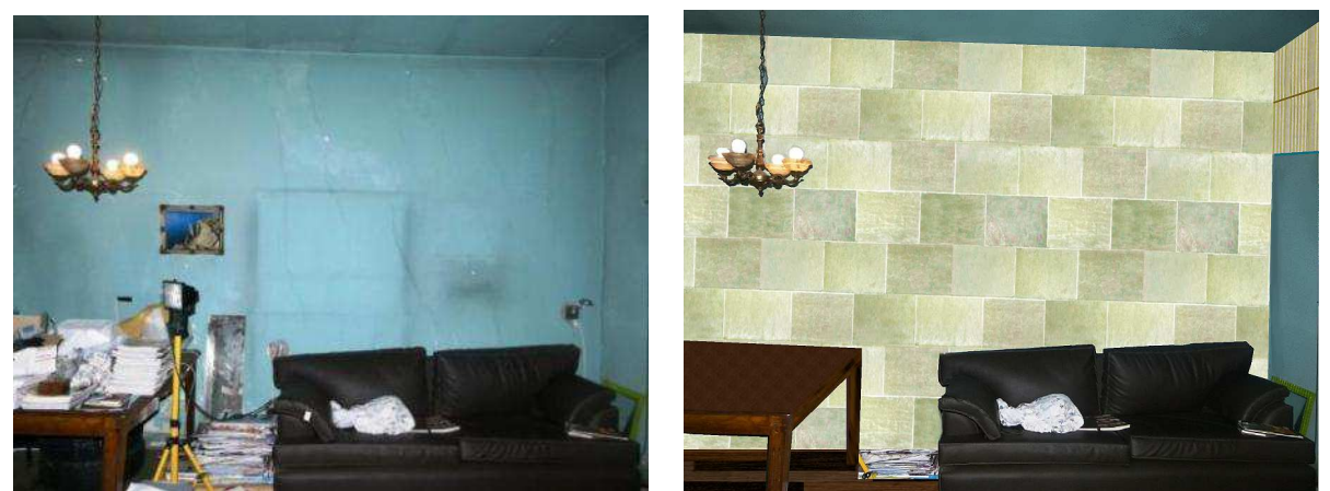
Fig. 7 "Prior to the intervention image: wall with visible cracks (left). Photomontage of wall cladding design (right)".

During this stage the walls cladding will be done using flat and embossed papercrete plates. The plates will be mounted on wooden slats forming an air chamber (Fig. 7). The existing cracks will be hidden this way, achieving a better hygrometric, thermal and acoustic performance which are fundamental topics for a divider wall.