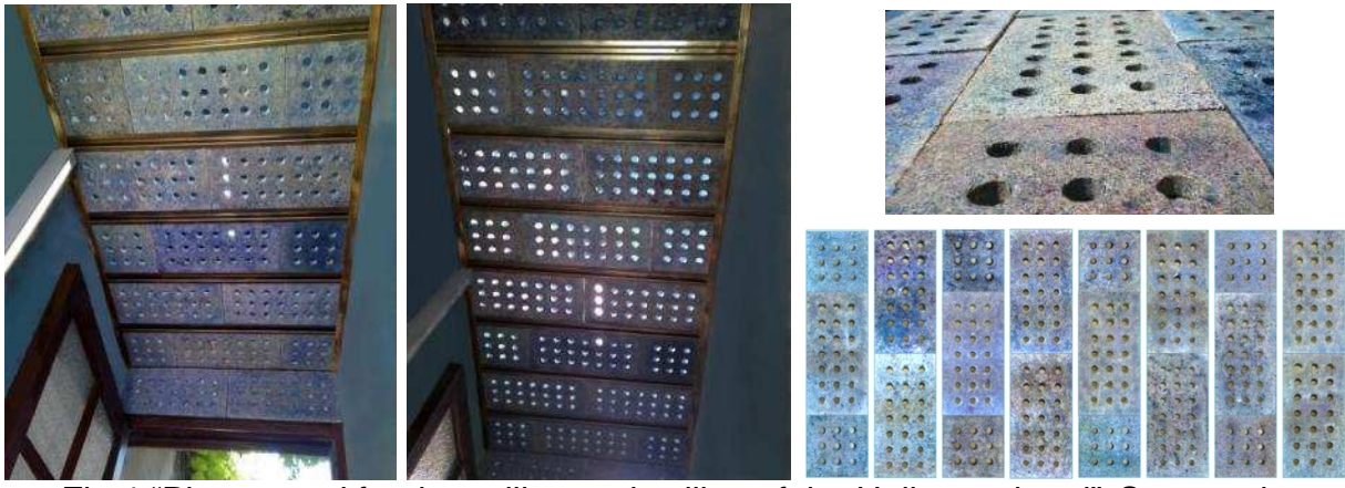
Fig 4 "Plates used for the ceiling and ceiling of the Hall completed".

The plates were assembled in half an hour by two people on omega decorative profiles, with satisfactory result (Fig. 4). Its advantages and possible disadvantages will be evaluated throughout two years from its placement.