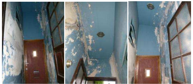
Fig. 3 "Photographic survey of the Hall".