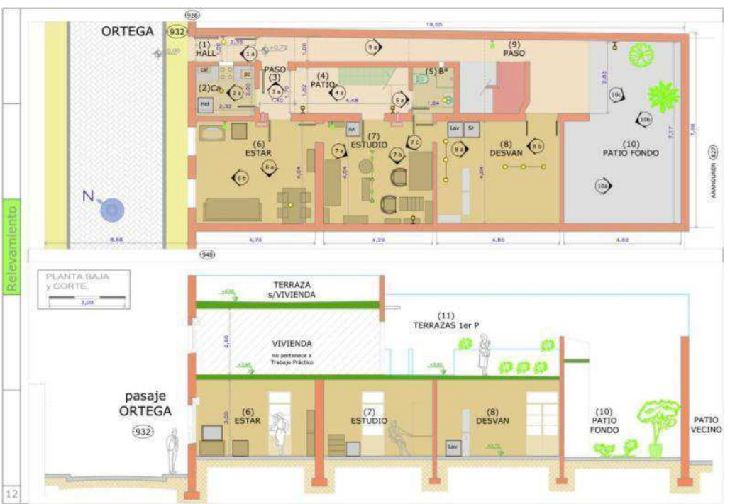
Fig. 1 "Survey plan of the Ground Floor".

Shown below the surveys carried out for the said seminar. In (Fig 1) survey of Ground Floor and in (Fig 2 and 3) photographic survey.