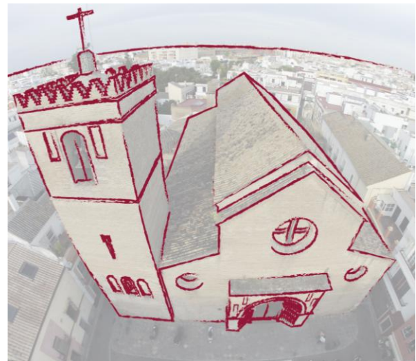
Figure 6: Logo for the church of Santa Marina from fisheye perspective taken through UAV. Design by architect Manuel Martín Vega.

On the other hand, it is easily checked that using fisheye lens with 170 degree opening, at certain distances and positions, make us perceive the filmed object as bended. This circumstance has been considered a new way for the experimental design of logos and iconique images (Fig.6).