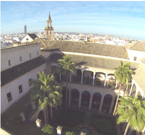
Figure 7: Courtyard sight of the Palace of the Marquesses de la Algaba, Mudejar Art Center of Seville.

Once shown the main advantages and possibilities of using UAV detected during the field work carried out, the main problems, constraints and inconvenients encountered are listed below: