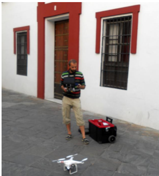
Figure 2: Equipment and employee. From "Vistaerea" low-rise flight video and photography platform.

The graphics and audio-visual information has been taken with photography services and ground flights conducted under the "Vistaerea" platform (Sanchez, 2013). As we can see in next chapter, the methodology used by the operator consists on displaying the frame of the camera via a video monitor in real time, and controlling the device helped by its GPS tracking (Fig.2).