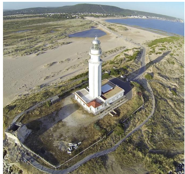
Figure 8: Trafalgar lighthouse in Barbate, Cadiz.

At the same time, many of these states are natural areas, and often they are also protected. Therefore, and as in urban areas, it is logical to think that the work of filming also contribute to its protection.