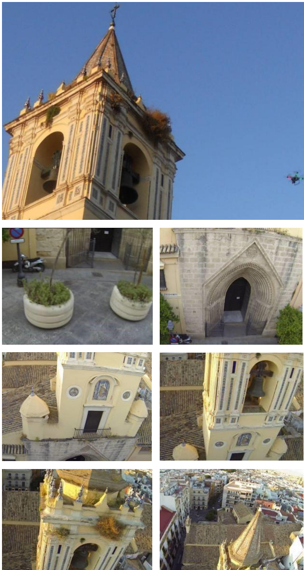
Figure 3: At the top, flight team performing environmental surveys of the church of San Isidoro. Below, sequence of frames recorded by "Vistaerea".

2.- Photographs : To this end, the camera is programmed, in an automatic mode, to take a photo by second. Thus, each flight provided around a hundred images that in many cases achieve greater precision and expressiveness than the "bird view" reached by manned flights currently. (Fig. 4).