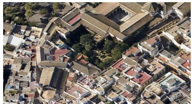
Figure 4: From top to bottom, aerial reconnaissance of the church of San Esteban: (1) Image courtesy of "Vistaerea "; (2) bird eye view "Bing, 2014"; (3) 45 degree aerial view from "Google maps, 2014."