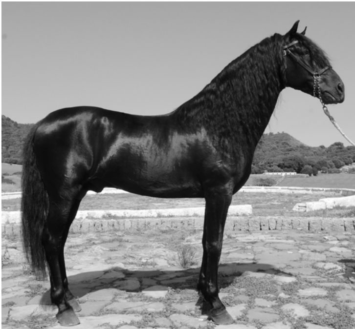
Figure 1 «Puderos» – typical Menorca horse, breed champion in 2010

The need to preserve genetic variability is essential and of maximum importance, given that it is the mainstay of genetic progress (De Rochambeau et al. 2000) and especially for this type of local breed with a small census. The breeding program of the PRMe has been developed by the Breeders' Association since 2007, in order to select breeding stock with the highest genetic potential for traits of economic interest, while maintaining as much genetic variability as possible by means of optimum selection procedures. The selection objectives involve both conformation and functional traits (ability to perform in classic dressage and Menorca dressage, a special type of dressage that includes the typical Menorcan movements the animals perform at the traditional festivities).