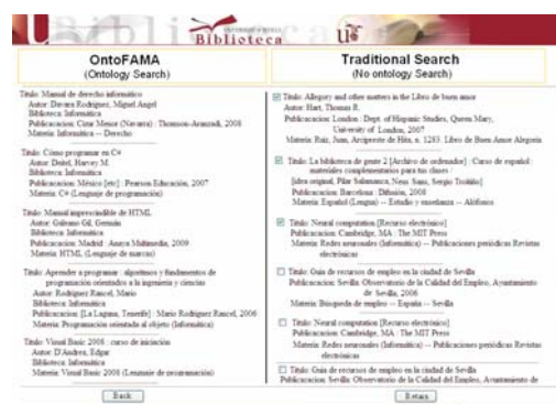
Figure 3: Search engine results page

The user inputs the keywords in the user profile interface. Suppose the user is looking for some resource about “Computer Science electronic resource” in the library digital domain of Seville. The required resources should contain some knowledge about “Computer Science” and related issues. After searching, some resources are returned as results, which are shown in figure 3.