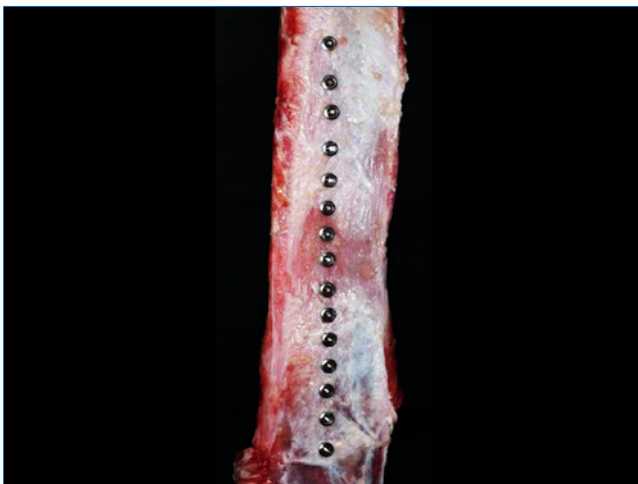
Figure 1. Fifteen implants placed in each rib, so that the rough/smooth interface was placed at bone crest level. The distance between the implants had to be at least 4 mm.

Once the implants were in place, primary stability was measured by means of RFA with the Osstell ISQ in five different situations, by a second experienced clinician in the use of the ISQ device. First, the ISQ was measured over the Smartpeg screwed directly to the implant. Then, it was measured over three Smartpeg screwed to the top of three different healing