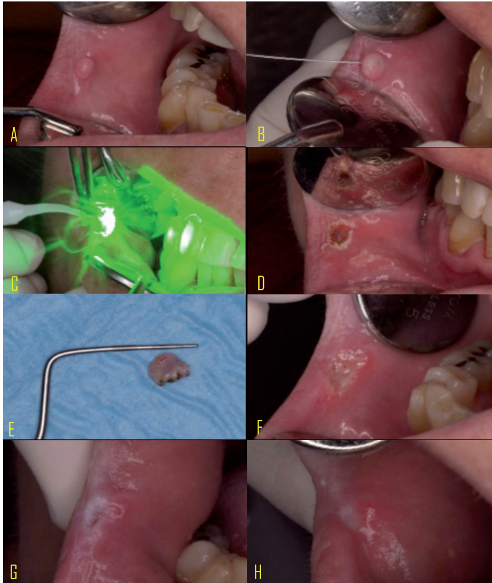
Fig. 2: KTP laser group. A Initial view of lesion; B Anesthesia ; C Excision of the lesion; D Lesion excised; E Immediate follow up; F 24 h follow up; G 14 days follow up; H 28 days follow up.

if they deemed necessary. If they took any medication prescribed or not, the time, the date and the amount had to be indicated in the NDC. Evaluation of postoperative parameters of pain, scarring, inflammation and consumption of drugs were recorded at the day of the surgery, 24 hours after, 14 and 28 days after. The researcher in the NDC had to fill out an evaluation form in an itinerary table.