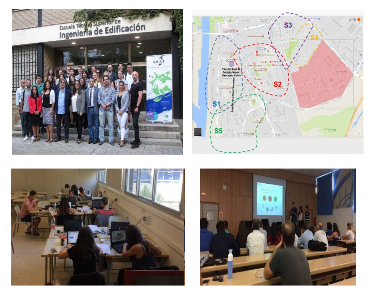
Figure 3. Working groups during SWAT in Seville. Clockwise: professors and students of the Building Engineering School, University of Seville, Urbanism Office of Seville and Delft Technological University, Netherlands; the neighbourhood map divided into working areas; students designing the projects; and the final presentations of their proposals.