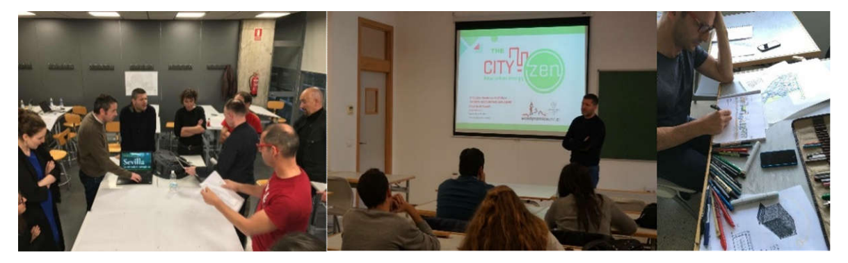
Figure 5. Roadshow activities in Seville.

of the presentation and represent the integrated outcomes of both workshops. The presentation of Workshop 1 would be qualitative in nature and include urban planning intervention proposals at the neighbourhood scale, together with spatial, social, and building regulation strategies. The third and final presentation would be quantitative, focused on energy strategies, scenarios, and carbon offsetting measures.