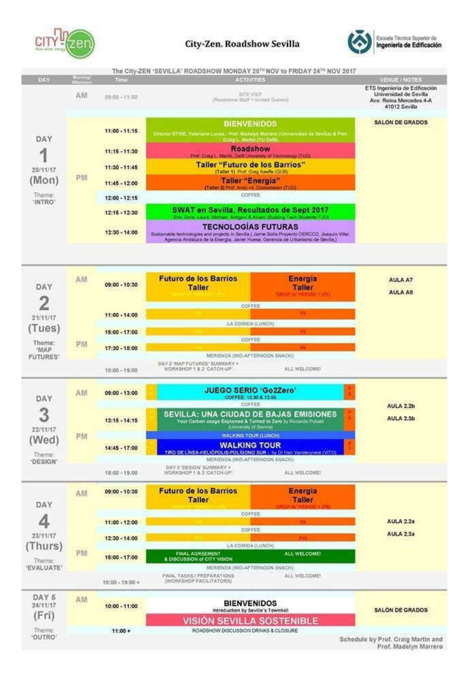
Figure 4. Timetable of the activities taking place during Roadshow.

IOP Conf. Series: Materials Science and Engineering 399 (2018) 012038 doi:10.1088/1757-899X/399/1/012038